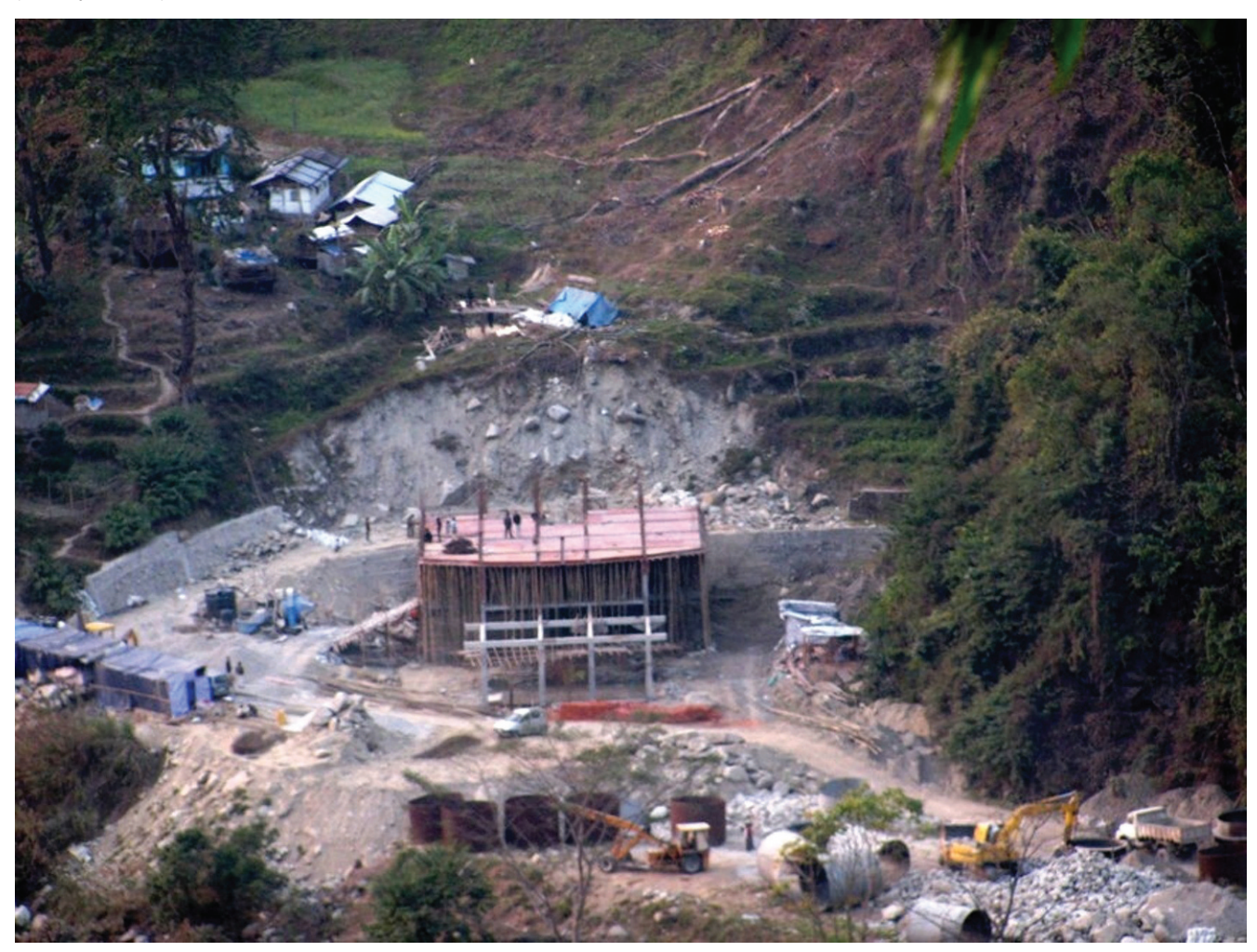
FIGURE 2 Site of a hydroelectricity project construction on former agricultural land in Sikkim. Remnants of agricultural terraces are visible around construction.

Many villagers said that the village forests they traditionally used for firewood and fodder collection were destroyed by construction work. Agricultural and forest land impacts were mostly temporary and could be reversed by applying suitable mitigation measures, as indicated in Table 1.