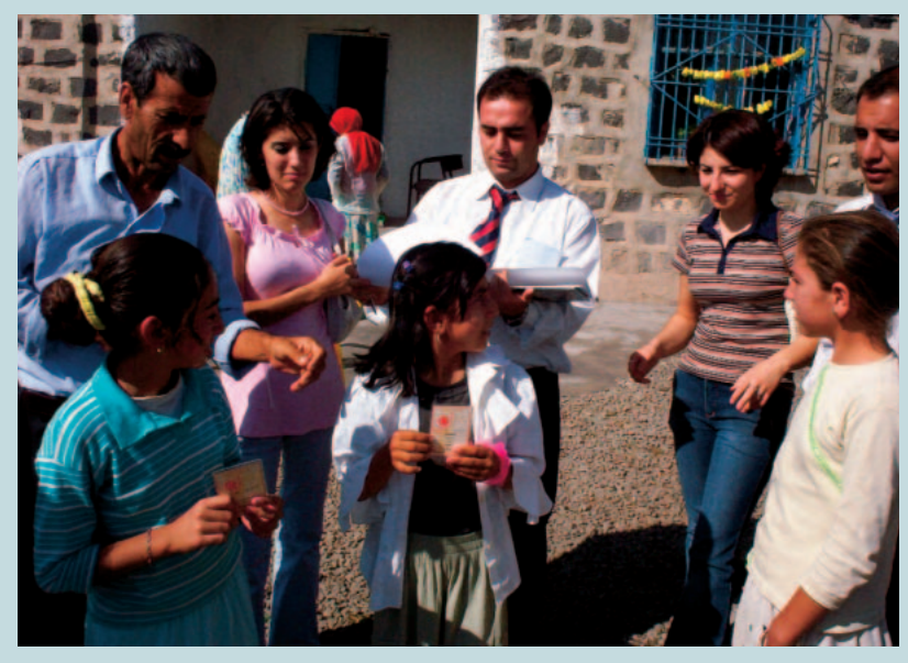
FIGURE 4 Güleçoba, Diyarbakır: girls whose parents are being persuaded to send them to school.

mental organizations (NGOs), private sector organizations, the media, community leaders, and volunteers willing to participate in the campaign become active. This step involves large-scale dissemination of information. The guidance counselors who will train the managers and teachers in their own schools have already been trained. This training is given in order to inform guidance counselors-the most important actors in the campaign-about the goals and application methods of the campaign. NGOs, professional institutions, and volunteers in the provinces and districts are also informed and trained in order to gain the support of the people and institutions previously mentioned.