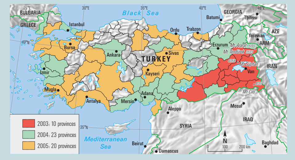
FIGURE 2 Provinces included in the "Off to School, Girls!" campaign, and date of their

The organizational structure and studies on how to execute the campaign are han-