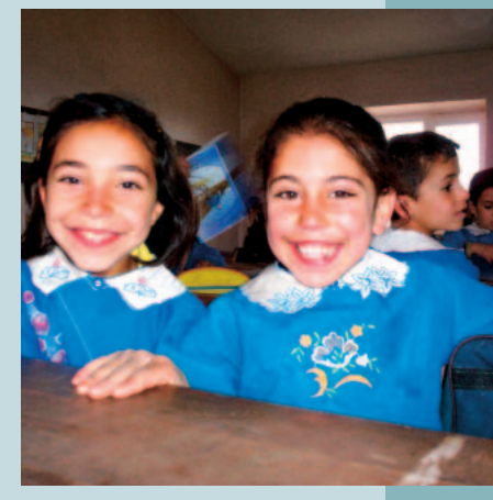
FIGURE 5 Girls and boys enrolled in school as a result of the campaign in Kırkkoyun, Diyarbakır.

Data on the results of the campaign for 2005 will be collected in the Central Coordination Bureau in Ankara by the end of December 2005, and the report will be published in 2006. The goal for 2005 is to enrol 300,000 girls in primary education and ensure that they continue. By 2015, in accordance with the MDGs, Turkey aims to provide primary education to all boys and girls in the country. Turkey has been making every effort to ensure that these children attend school.