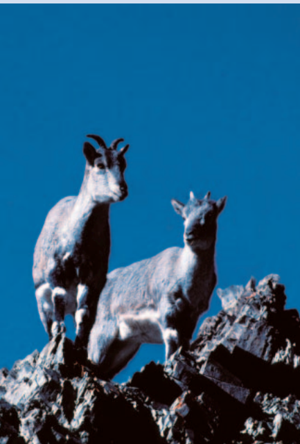
FIGURE 1 The blue sheep or bharal ( Pseudios nayaur nayaur ), found in the 3 lake areas in Changthang, is considered a low risk, near threatened species.