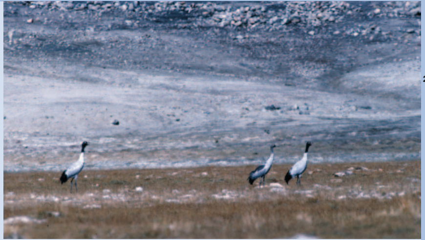
FIGURE 3 The globally threatened black-necked crane ( Grus nigricollis ) is sacred to the local population. The WWF is working in 3 wetlands, the most important breeding grounds for this species outside China.

Water resources in this region are vital. The mountains here are a source of some