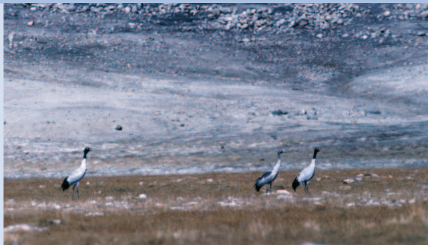
FIGURE 3 The globally threatened black-necked crane ( Grus nigricollis ) is sacred to the local population. The WWF is working in 3 wetlands, the most important breeding grounds for this species outside China.

Water resources in this region are vital. The mountains here are a source of some