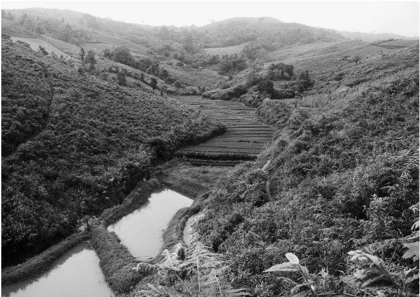
FIGURE 3 Example of the type of land use considered by the government as 'backward,' unproductive, and environmentally detrimental: swidden-fallow landscape with fishponds, paddy, rainfed crops, fruit trees, fallow, etc in Mengsong Hani Administrative Village, Menglong Township, Jinghong County, Xishuangbanna. Today, the value of such mixed management is assessed far more positively.

With economic reform in the late 1970s, disillusioned 'educated youths' working in Xishuangbanna initiated what became the 'Return to the Cities' national protest movement. Many state rubber farms nearly collapsed. Some upland Hani villages were persuaded to move to lower altitudes to provide state workers to meet the labor deficit after the departure of the 'educated youths.' In order to make them more efficient