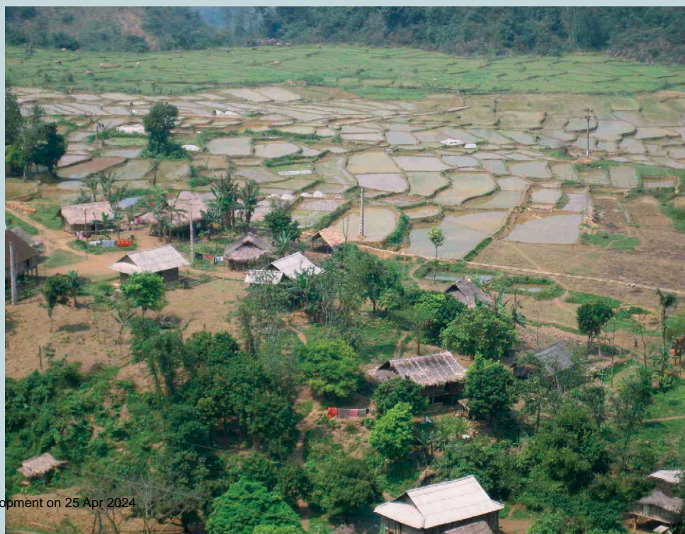
FIGURE 1 Rice paddy cultivation on the floor of the valley, Hoa Binh Province.

Our data suggest that there is a disconnection between official policies and local understanding of the appropriate implementation of land use policies. For example, district officials in Tuong Duong district have allocated land differently from the methods deemed appropriate by the central government. People at the commune and hamlet levels often report that land allocation is incomplete; moreover, farmers are often unaware or have an incomplete understanding of policies implemented at the provincial and district levels. In one commune in Tuong Duong district, for instance, the commune officers report that 4 of 5 hamlets had land allocated in 1998/1999. One hamlet refused to allow the land allocation at that time; instead, land was allocated in 2001/2002, at which time a different allocation system was used by the district officials. Here we should understand the problem that local authorities face due to the many land policies and laws that have been issued over time (1993,