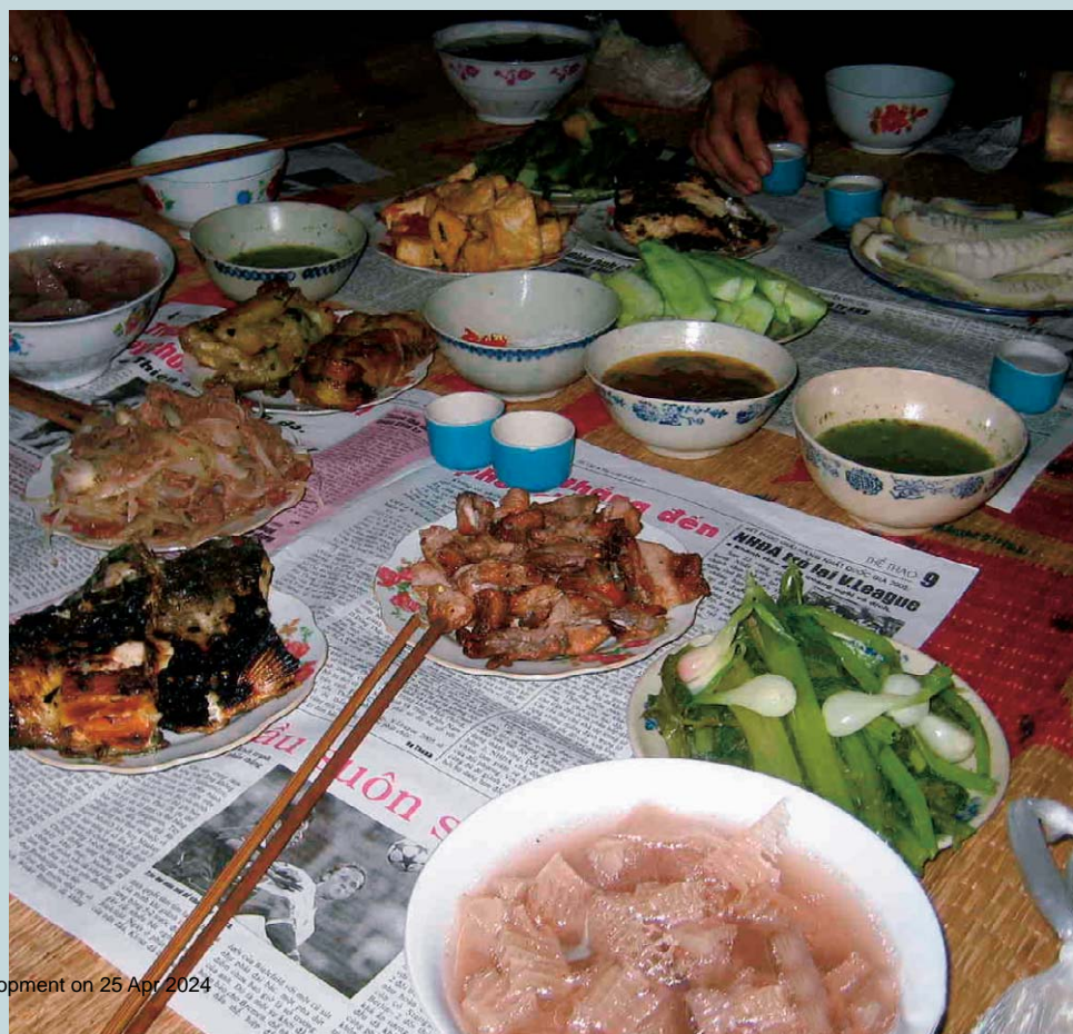
FIGURE 3 Thai meal to welcome visitors to a house in Son La Province: an example of food security increased by CSA.

Swiddening is not the main cause of poverty or environmental degradation in upland Vietnam; rather, it is often a rational way of keeping poverty at bay under difficult circumstances. For a variety of reasons, swidden farmers are generally poor and belong to the most vulnerable groups in Vietnamese society. Changing farming