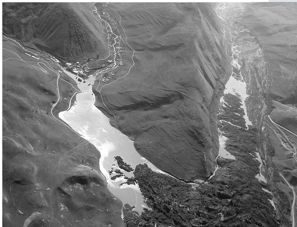
FIGURE 4 View of the mass blocked by the Skalistyi Ridge, and of the rising lake near Saniba.

Indeed, the Upper Karmadon thermal springs, with a temperature up to 60°C, are situated not far from the end of the Maili Glacier. Therefore, one can hypothesize the existence of special thermal conditions under the glacier that may have initiated its melting from underneath, thus forming a water “cushion” on its bed. This would have accelerated the glacier surge. It should be noted that during the 9 years of monitoring in the 1970s, no signs of gas emission were observed.