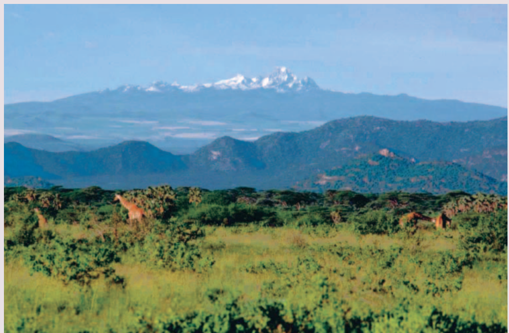
FIGURE 1 The Mount Kenya highland–lowland system.

The basin is characterized by highly diversified ecological systems and zonal differentiation. It includes the nival mountaintop, the moorlands above the timberline, a belt of tropical rainforest, the semihumid footzone of the tertiary volcano, the semiarid high Laikipia Plateau, the escarpment, and the semiarid to arid Samburu Plains. The ecological