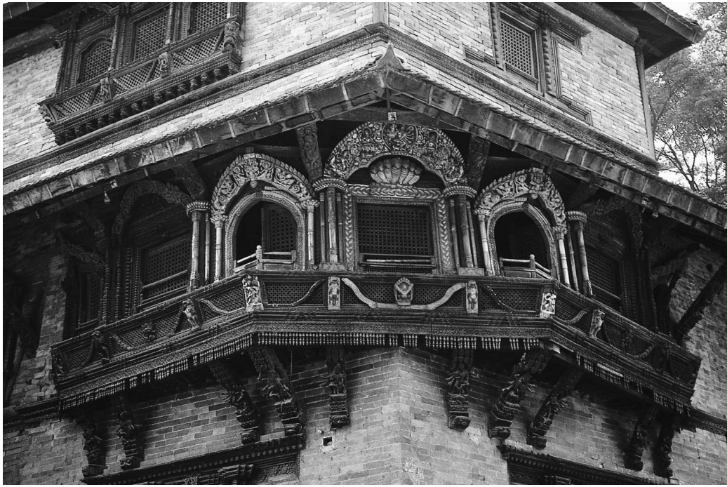
FIGURE 3 Sal (Shorea robusta) is a highly valuable wood used for construction and sometimes for traditional carving; its value is thus also cultural – and, from the more recent perspective of the tourism industry, economic.