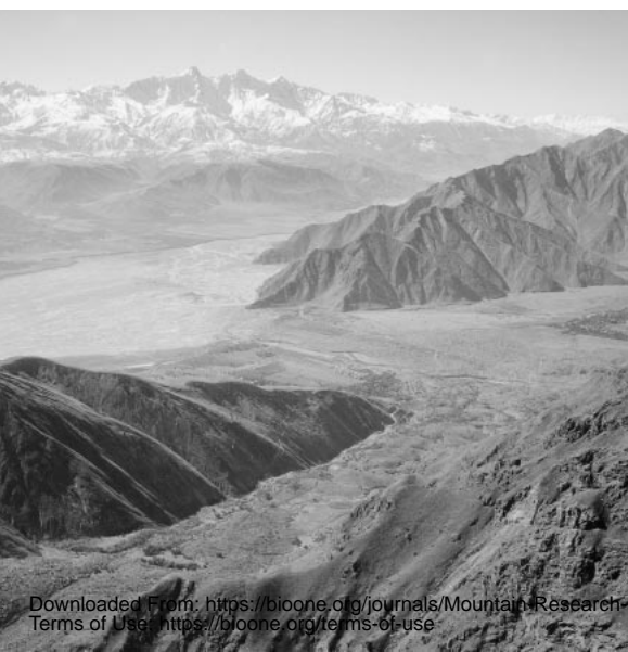
FIGURE 2 Aerial view of the lower Surkhob Valley in the Tajikistan Pamir. The valley floor, from the bottom left almost as far as the main river, is buried under the rock debris that resulted from a massive rockfall and landslide triggered by the major earthquake of 1949. The rock debris covers the former site of Khait, the regional administrative center.

occurrence of large landslides, for instance, that blocked valleys and dammed up ephemeral lakes. Subsequently, some of these lakes must have drained catastrophically. One of the more recent of the landslide lakes is Lake Sarez. It originated following an earthquake that occurred during the winter of 1911 and today is more than 60 km in length and over 500 m deep (Alford et al 2000).