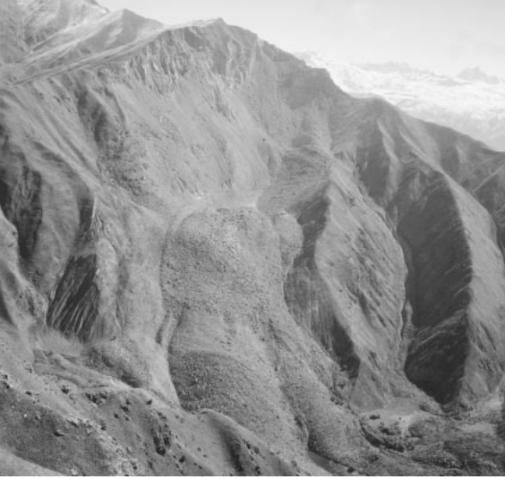
FIGURE 3 Aerial view of the point of initiation of the July 1949 landslide. This view clearly shows that a large part of the upper mountain slope was discharged, with debris tumbling down the valley for more than 12 km, destroying not only Khait but many small villages as well.

air wave, such as would be generated by a powerful explosion, preceded the stone jumble and smashed fleeing people. All other sounds were drowned in the booming rumble of the unimaginable rock storm. In a matter of minutes, Khait had ceased to exist. A tangle of stone hills, 40–60 m in height, was all that remained. The rock stream had choked the riverbed of the Yarchich for hundreds of meters and, like a stone wave, had rolled up the opposite valley side.