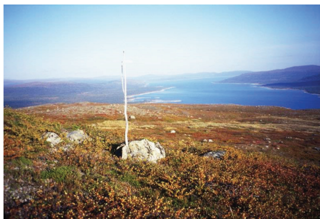
FIGURE 2. Stone cairn marking an old path leading to the slaughtering place of Boarek. Photograph by John Kuhmunen, 1999. Sirges community (Source: Åjtte, Svenskt Fjäll- och Samemuseum).

In Suorvvá [meaning the space where you can sit at the back of the sled], there is this formation