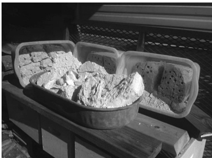
Fig. 3. A 2nd daughter nesting aggregation of Anthophora abrupta established 35.7 km from the original nest site in Gainesville, Florida. It was created as a split from the mother nesting aggregation in Mar 2014.

Our observations at the daughter nest aggregations suggest that we were able to establish 2 new nest aggregations of chimney bees successfully. Flight activity at the daughter nest sites was lower than that at the mother nest site. However, this gradually increased in the 1st daughter nest aggregation to reach that of the mother nest aggregation by the 3rd year after the establishment of the 1st daughter nest aggregation. The 2nd daughter nest aggregation had comparable activ-