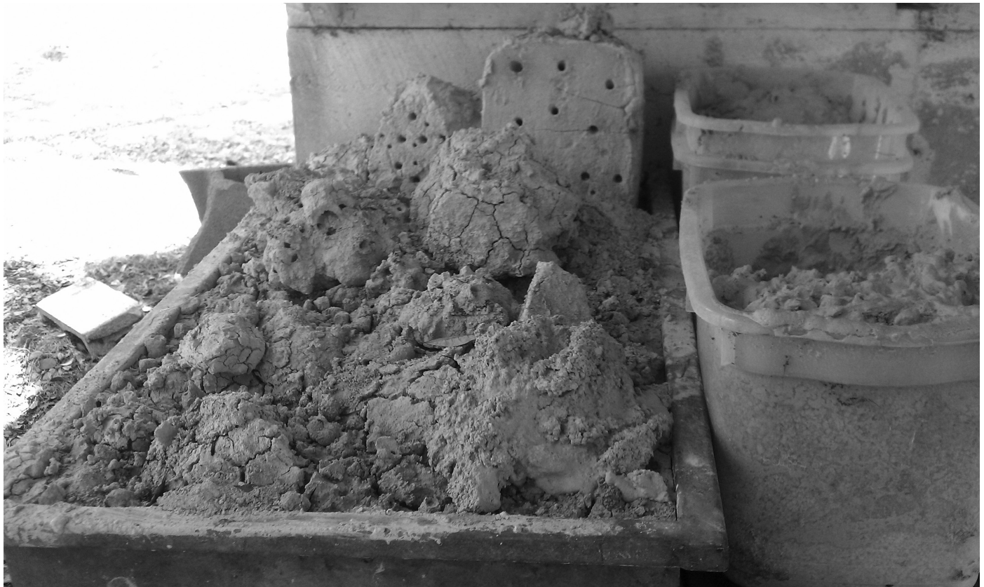
Fig. 2. The 1st daughter nesting aggregation of Anthophora abrupta established 10.3 km from the original nest site in Gainesville, Florida. It was created as a split from the mother nesting aggregation in Mar 2012.

In Apr 2014, the nest aggregations were observed in anticipation of emerging adult A. abrupta . At the mother nest aggregation, on Apr 21, a faint crackling sound in the clay was noted, and adult A. abrupta bees were observed emerging at the mother site on Apr 26, 2014. At the 1st daughter site, the adults were seen emerging on Apr 28, 2014. Adults were not observed emerging at the 2nd daughter site until Apr 30, 2014. Nesting by A. abrupta continued at the mother site and 1st