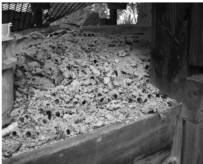
Fig. 1. The original (mother) nest aggregation of Anthophora abrupta discovered in Apr 2010. The bees were nesting in colloidal clay, in an open air shed, in Gainesville, Florida.

Observations of the A. abrupta nest continued in Apr, May, and Jun in 2010. Adults were seen only rarely in mid Jun 2010. After Jun 28, adults were not observed until the following Spring. The observations of the 1st season led to the hypothesis that A. abrupta adults emerging from the existing nest in Spring 2011 would excavate and provision nests in nearby clay if it was provided in portable containers. By using the containers, the nests could be dispersed to seed new areas. With only 1 nesting aggregation of locally rare A. abrupta identified for use, attempts at augmenting the population carried the risk of causing unintended harm to the very population being studied. However, a small split was taken carefully from the original