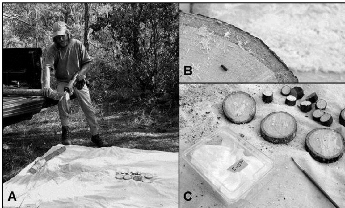
Fig. 1. Method for collection of live redbay ambrosia beetles, Xyleborus glabratus , using freshly-cut host wood as bait deployed in the late afternoon near trees symptomatic for laurel wilt. Branches from Persea spp. were cut into cross-sectional disks; cut wood and sawdust were placed in center of cotton sheet (A). Ambrosia beetles landing on the bait or surrounding sheet (B) were collected by hand with a soft brush and stored in plastic boxes containing moist tissue paper (C).

counted and identified according to Rabaglia et al. (2006), and voucher specimens deposited at SHRS (Miami, Florida) and at Archbold Biological Station (Lake Placid, Florida).