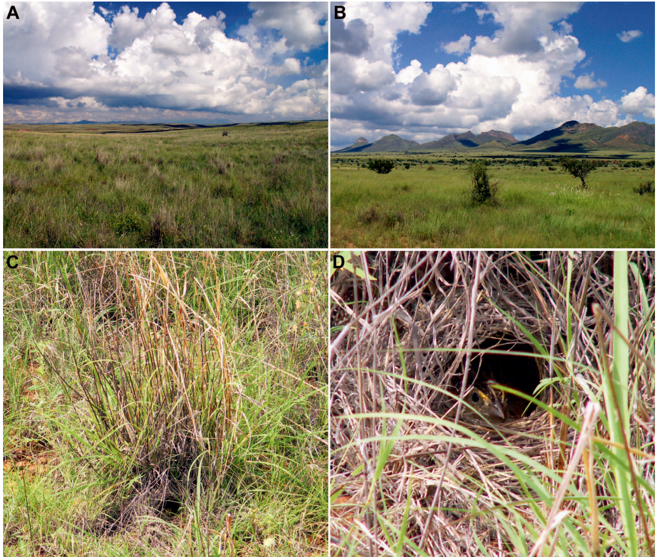
FIGURE 1. Grasshopper Sparrow study sites in southeastern Arizona (August 2012). (A) Davis pasture on Las Cienegas National Conservation Area has lower shrub density than (B) Audubon Appleton-Whittell Research Ranch. Female Grasshopper Sparrow on her nest (C and D) constructed beneath a native cane bluestem ( Bothriochloa barbinodis ) clump (July 2012).

(Audubon; 3,200 ha, 31.60°N, 110.51°W, elevation 1,497 m) and Davis pasture (Davis) on the Bureau of Land Management (BLM) Las Cienegas National Conservation Area (NCA) (1,560 ha, 31.70°N, 110.60°W, elevation 1,430 m; Figure 1A,B). These study sites were 2 of 7 sites located throughout the desert grasslands of southeastern Arizona that were studied previously for grassland bird winter habitat use (Ruth et al. 2014). These 2 sites were selected because land managers provided access for breeding ecology studies and because the density of Grasshopper Sparrows ensured the necessary sample sizes for territory and nest plots. We considered these sites to be representative of Grasshopper Sparrow habitat based on distribution surveys conducted throughout the U.S. range of the subspecies (Ruth 2008).