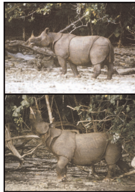
Fig. 1. —Rare images of an adult male Rhinoceros sondaicus from Ujung Kulon, West Java, in 1978; note the diagnostic dermal shields and prehensile upper lip used to grab forage in the bottom image.

Rhinoceros sivalensis Falconer and Cautley, 1847:pl. 73, figs. 2 and 3; pl. 74, figs. 5 and 6; pl. 75, figs. 5 and 6. Type locality “upper Siwaliks,” restricted to “Ratnapura series,” Ceylon by Deraniyagala (1938); fossil probably from the Upper Pleistocene.