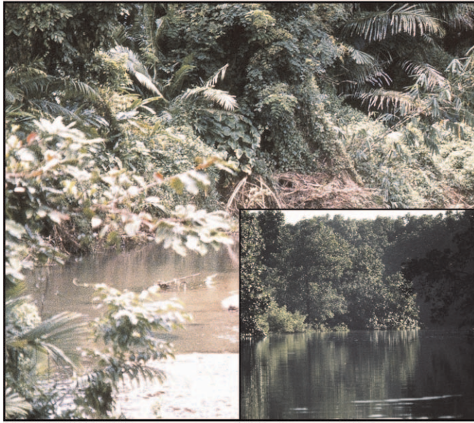
Fig. 7. —Typical stream and river (inset) habitats in Ujung National Park, West Java; Rhinoceros sondaicus often forages along the banks of such areas and uses them to wallow when those in the forest interior dry up.

Wallows also can be detected by well-worn paths, muddy vegetation, and trees that have been repeatedly rubbed with the head and horns of departing rhinoceroses. The reasons for wallowing include thermoregulation, skin conditioning, avoidance or removal of ectoparasites, and olfactory advertisement by impregnating the skin with the urine-rich water of the wallow (Ammann 1985; Hoogerwerf 1970; Schenkel and Schenkel-Hulliger 1969a; Sody 1959). When such wallows dry up during drought, R. sondaicus frequents edges of muddy river banks and tidal forests (Fig. 7; see video at http://www.arkive.org/javan-rhinoceros/rhinoceros-sondaicus/video-so08.html , accessed 15 September 2010).