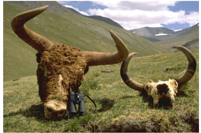
Fig. 3. —Skulls of male (left) and female (right) wild yaks ( Bos mutus ) from Yeniuogou, central Qinghai, China, highlighting relative mass and sexual dimorphism in skull size and horn shape.

Relative to mass, a small female wild yak may be only one-third the size of a large male; in contrast, female domestic yaks are 25–50% smaller (Harris 2008; Miller et al. 1994; Wiener et al. 2003). Body mass (kg) of adult male wild yaks has been estimated at >800 kg (Engelmann 1938) and as high as 1,000 kg (Schäfer 1937; Wiener et al. 2003:43) and 1,200 kg (Lu 2000; Lu and Li 1994); females are about