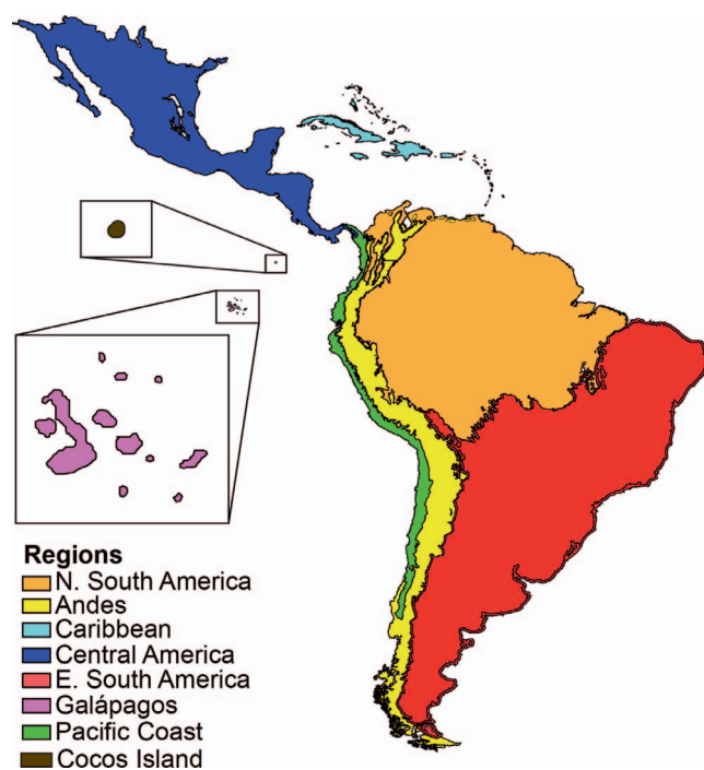
FIGURE 1. Map of biogeographic areas used in BioGeoBEARS eight-area regime. Five-area regime combined the four regions of South America mainland that are shown here.

likelihood analyses (>70 Bootstrap Support). This change in topology potentially alters the biogeographic interpretation of the origin of Darwin's finches. In addition, advances in biogeographic analyses in the last 15 yr indicate that a reassessment of the biogeography of the group is warranted. The R package BioGeoBEARS provides a framework for testing maximum likelihood and Bayesian models to reconstruct ancestral ranges (Matzke 2013a). The ability to customize models within this package allows new model types to be compared in addition to more widely used models. Therefore, we use the Burns et al. (2014) phylogeny and the more modern statistical approaches available through BioGeoBEARS to test a variety of biogeographical models. Using maximum likelihood, we estimate the ancestral ranges for all species in the subfamily Coerebinae and provide an update to the biogeographical analyses of Burns et al. (2002). Using this reconstruction, we evaluate the 2 proposed hypotheses for the origin of Darwin's finches in an attempt to provide consistency to the literature and to better understand the evolutionary context from which this radiation evolved.