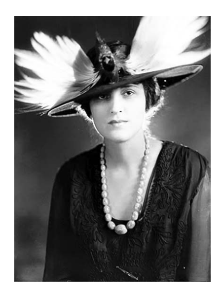
FIGURE 1. Woman with bird hat circa 1900. The bird is a near complete specimen of either a Great ( Paradisaea apoda ) or a Lesser ( P. minor ) bird-of-paradise (fide Bruce Beehler).

Other countries soon tried to follow the United States' lead ( The Auk 31:289). It was reported that Parliament in Great Britain was considering a law banning importing feathers. The great German naturalist Carl Georg Schillings wrote that the United States had found the only solution to the problem and that if Great Britain banned