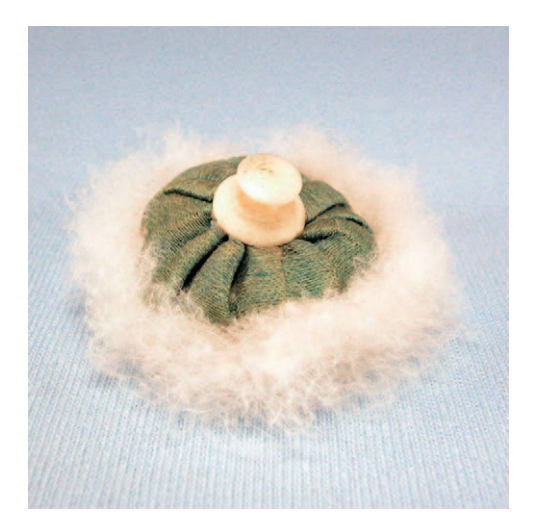
FIGURE 2. A powder puff made of swan's down.

then the cat deserves consideration but if the keeping of cats is to be regarded as merely a 'luxury' or if they are proven to be more noxious than beneficial to wild-life then their possession should be guarded with stringent restrictions, embodying registration or taxation." He concluded: "Is it not time that the sportsmen, the Department of Agriculture, and the Audubon Societies join forces in giving the cat question serious attention?"