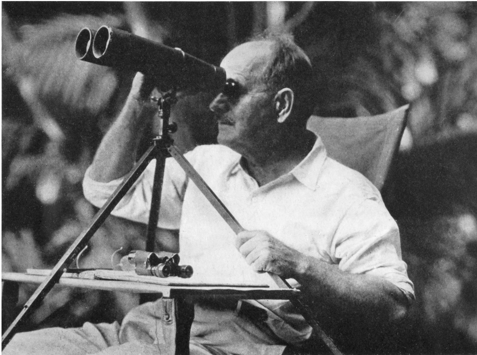
FIG. 1. Frank M. Chapman studying Chestnut-headed Oropendolas ( Psarocolius wagleri ) on Barro Colorado Island, Panama, circa 1927 (from Chapman 1931; plate facing page 83; photographed by F. E. Lutz). "My observation-post was the open space beneath my house, situated about 100 yards from the Oropéndolas' tree and fifty feet below the average nest-level. Seated in a camp-chair ... and using a 24-power binocular mounted on a tripod, the birds, wholly unaware of my presence, seemed to be within reach of my hand." The small glass on the table is probably a Carl Zeiss Jena Turex or Turexem, 6 × 21, an instrument manufactured between 1914 and 1920. Identification of the big 24× glass is more problematic. Zeiss made a 24 × 60 spotting scope, the Asiola, in the 1930s. Zeiss also manufactured a binocular version, the Asiolabi, also 24 × 60, one of the rarest of all Zeiss glasses.

books My Tropical Air Castle (1929) and Life in an Air Castle (1938) are great reads. I especially like the description of his experiments on the discovery of food by olfaction in Turkey Vultures ( Cathartes aura ) and his attempts to prevent coatis ( Nasua narica ) from reaching food attached to a piece of rope. While on BCI, Chapman took photographs, by trip-wires, of shy, nocturnal mammals like ocelot ( Felis pardalis ), puma ( Felis concolor ), and tapir ( Tapirus bairdii ) (see, for example, the extraordinary plate of a tapir dripping water from its nose, opposite page 229 in My Tropical Air Castle .) Chapman's lists of species on BCI from the 1920s to the 1930s served as basic surveys for later work (Eisenmann 1952, Willis and Eisenmann 1979), which in turn led to considerations about conservation (Wilson and Willis 1975).