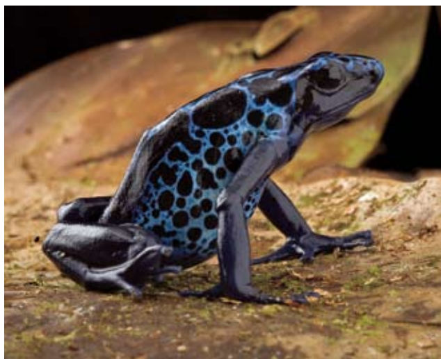
Blue Poison Dart Frog ( Dendrobates tinctorum )