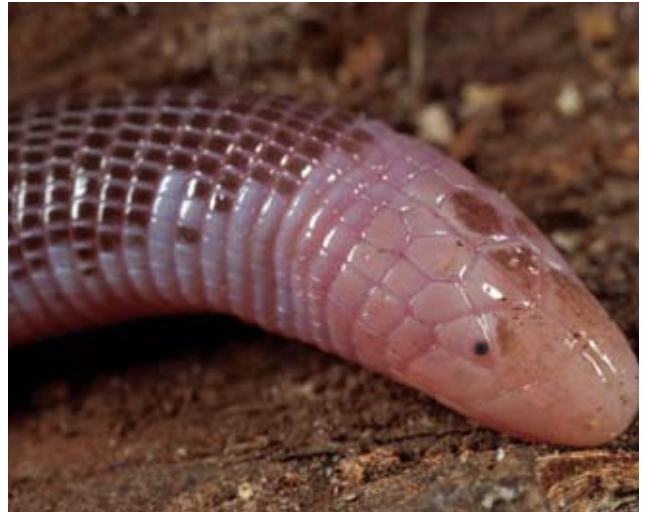
Worm Lizard ( Amphisbaena vanzolinii ) is legless and without functional eyes