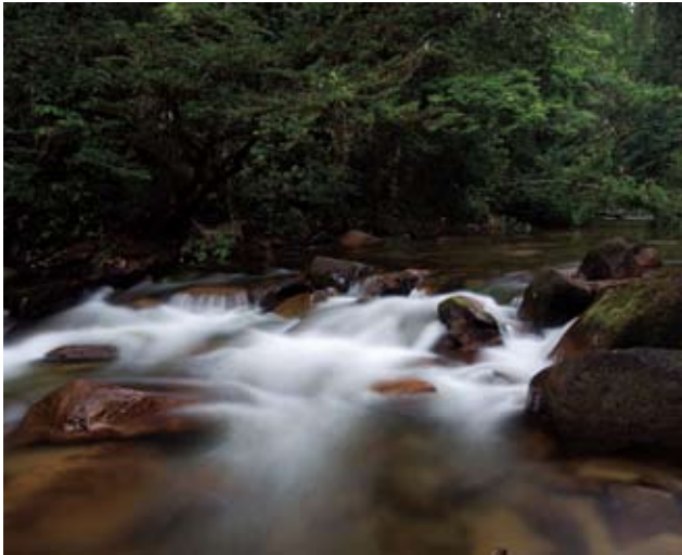
A pristine stream in the Acarai Mountains, the first site of the RAP survey