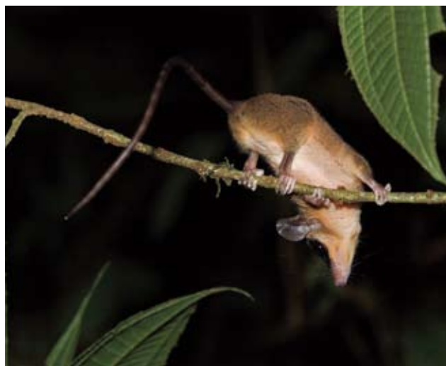
Mouse possum ( Marmosa sp.)