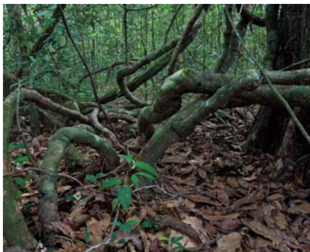
Forest floor of a typical, annually inundated forest along the Kamo River