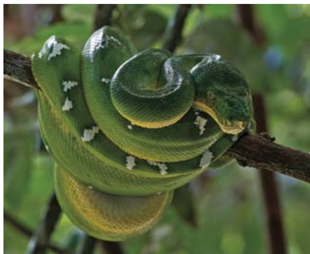
Emerald Tree Boa ( Corallus caninus ) coiled in a tree