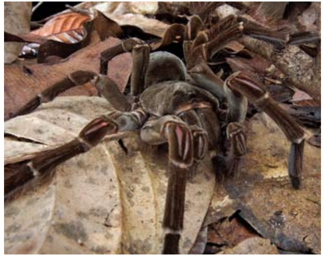
Giant Bird-eating Spider ( Theraphosa blondi ), the largest spider in the world