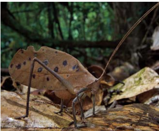
Peacock Katydid ( Pterochroza ocellata ) amid leaf litter