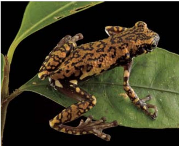
Tukeit Hill Frog ( Allophryne ruthveni )