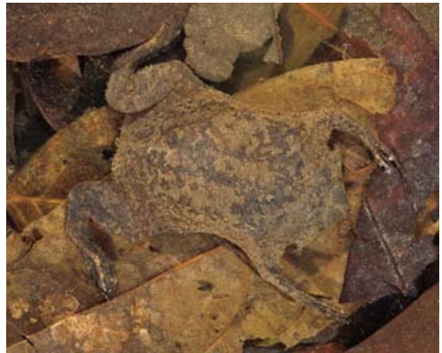
Surinam Toad ( Pipa pipa ) mimicking leaf litter at the bottom of a forest pond