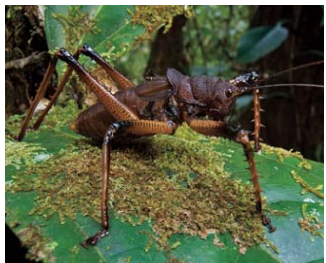
Lobster Katydid ( Panoploscelis specularis ), one of the largest katydids of the Neotropics