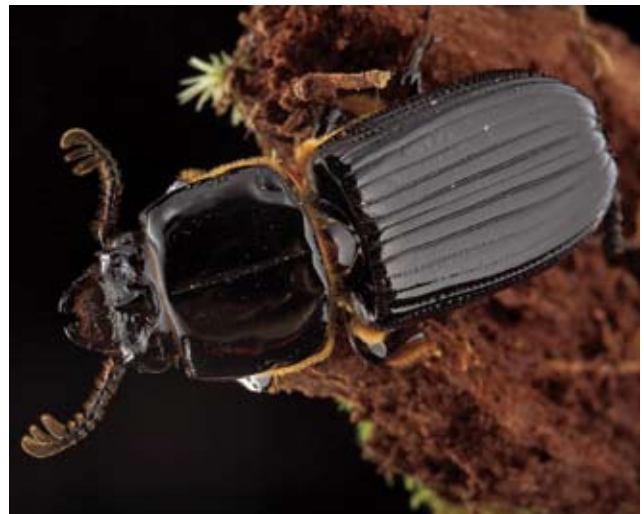
Bess Beetle ( Passalus sp.)