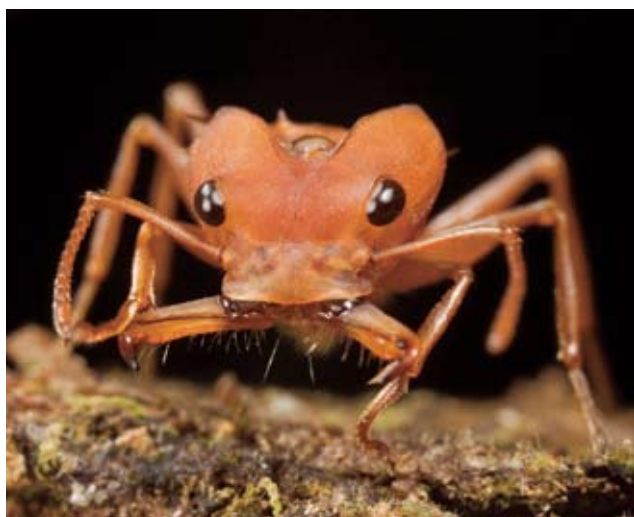
Large-headed Ant ( Daceton armigerum ) showing large mandibles