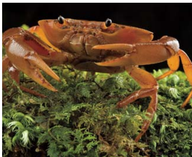
Freshwater Crab ( Fredius sp.) can sometimes be found outside of water, foraging on the forest floor