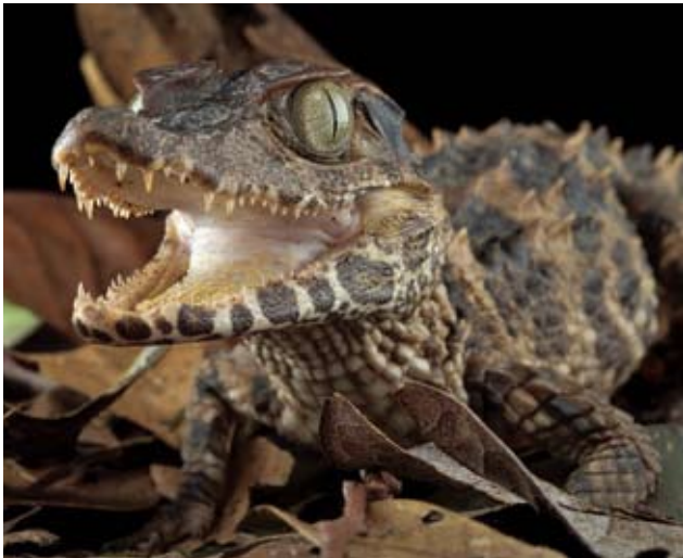
Smooth-fronted Caiman ( Paleosuchus trigonatus ) young, this species prefers more turbid waters than other species of the genus