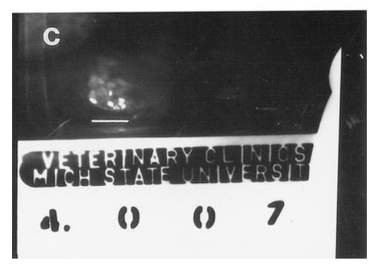
FIGURE 1. Radiographs of steel (a), tungsten-iron (b), and tungsten-polymer (c) pellets in the proventriculus/ventriculus of mallards. The radiographs were taken 10 days after the final administration of eight pellets (40 pellets total). The numbers refer to the duck's individual identification numbers. Notice the extent of erosion of tungsten-iron and particularly tungsten-polymer pellets compared to steel pellets. Bar = 10 \, \text{mm} .

posure periods in these studies were considerably shorter than in the present study.