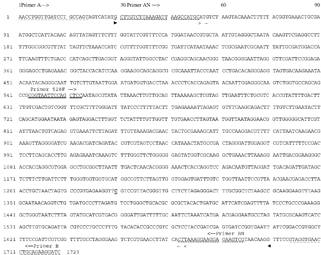
FIGURE 1. Babesia odocoilei small subunit ribosomal RNA (SSU rRNA) gene sequence with denotation of oligonucleotide primer sequences and positions. The SSU rRNA gene sequence from the Pennsylvania (PA) and New York (NY) reindeer and from Minnesota (MN) musk ox 2 isolates is identical to the gene sequence of B. odocoilei (GenBank accession no. U16369). The SSU rRNA gene fragment sequence for the MN musk oxen 3 and 4 isolates begins at position 30 and ends at position 1,687 (►, ◄). The New Hampshire (NH) elk isolate sequence begins at position 55 and ends at position 1,662 (>, <). The California (CA) bighorn sheep and MN musk ox 1 isolate sequences begin at position 56 and end at position 1,660 (→, ←). All sequences were identical to that of U16369 except for a single base substitution in the CA bighorn sheep isolate sequence (thymidine for a cytosine at position 1,290; bold type, underlined). The positions of primers A and B are indicated by broken underlining, of primers AN and BN by dotted underlining, and of 528F by bold underlining. Primer orientation is indicated by arrows.

created using the ClustalW 1.8 Program ( http://searchlauncher.bcm.tmc.edu/multi-align/multi-align.html ).