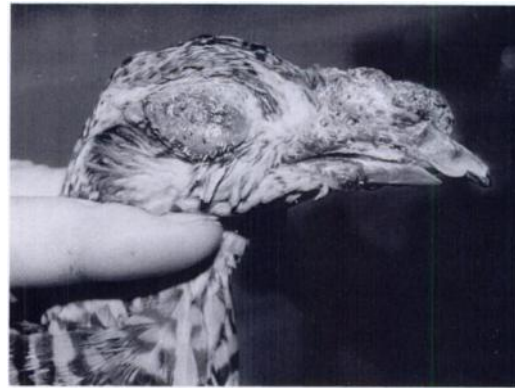
FIGURE 1. Multiple firm to fluctuant lesions due to reticuloendotheliosis on the head of a female wild-caught greater prairie chicken ( Tympanuchus cupido pinnatus ).

Frozen serum and plasma from 25 APC and 45 bobwhite quail ( Colinus virginianus ) collected between 1987 to 1993 from the APC National Wildlife Refuge (Eagle Lake, Texas, USA) were tested by virus isolation and virus neutralization to determine the prevalence of infection and antibodies in wild birds. In March 1995, two wild adult male APC captured on the refuge were bled and tested as described above.