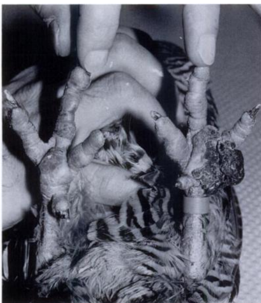
FIGURE 2. Multiple firm to fluctuant lesions of reticuloendotheliosis on the legs and feet of a female wild-caught greater prairie chicken ( Tympanuchus cupido pinnatus ).

plump, cytoplasm-replete, histocyte-like cells (Fig. 3) to elongated, slightly fusiform cells (Fig. 4) was suggestive of lesions of RE infection observed in other species (Li et al., 1983; Witter, 1991). Reticuloendotheliosis virus was isolated and viral antigen was identified by PCR and ELISA in tumors from both birds. Neither of these two birds was tested for REV before euthanasia.