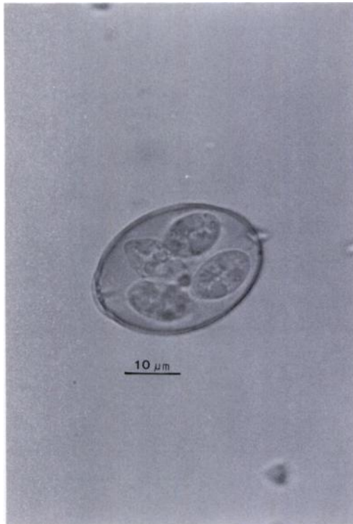
FIGURE 1. Photomicrograph of the oocyst of Eimeria sp. detected in fecal samples of mouflon from Central Spain, 1993.

in all animals but in a low intensity (1% and 3% of total oocysts, respectively).