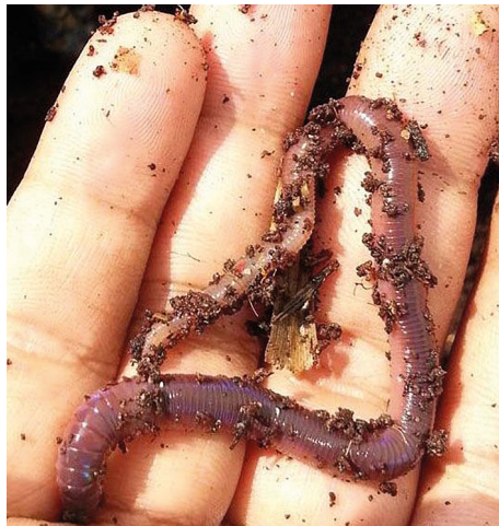
Fig. 1. A Eudrilus eugeniae specimen from a vermicompost site.