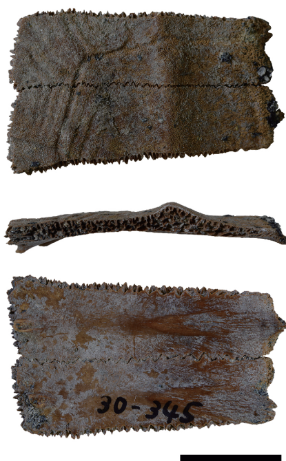
FIG. 2. Right second and third costals of Mauremys reevesii (HPMH-30A00392) from a late medieval (mid- to late 15th Century) pit-filling deposit at the Kusado Sengen-chō site. Scale bar represents 1 cm.

mutual sutural connections attributed to a single individual (HPMH-30A00392).