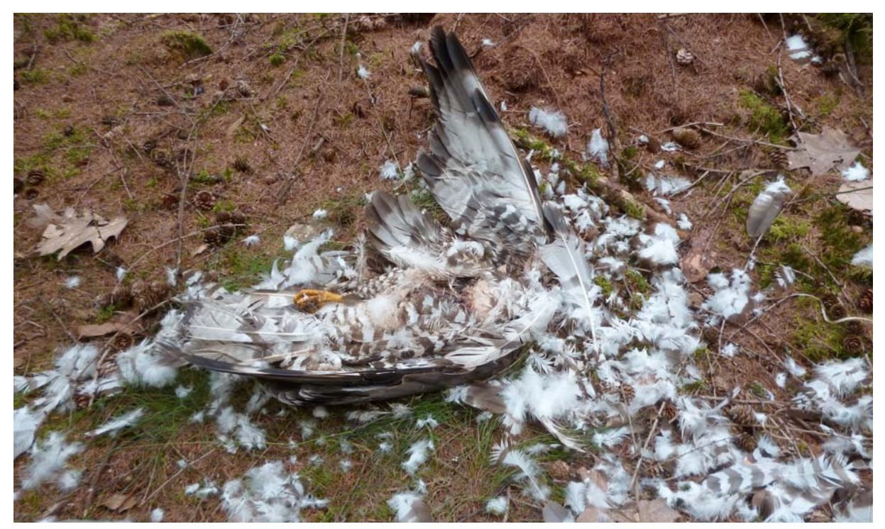
Adult male European Honey-buzzard killed and partly eaten by Northern Goshawk, underneath its nest in the forestry of Smilde, northern Netherlands, 17 June 2014, a regular sight in Dutch woodlands. Predation is the major mortality factor on Dutch breeding grounds.

The return of predators, in The Netherlands equating with a ten- to twentyfold increase in breeding numbers and distribution of many raptor species, had