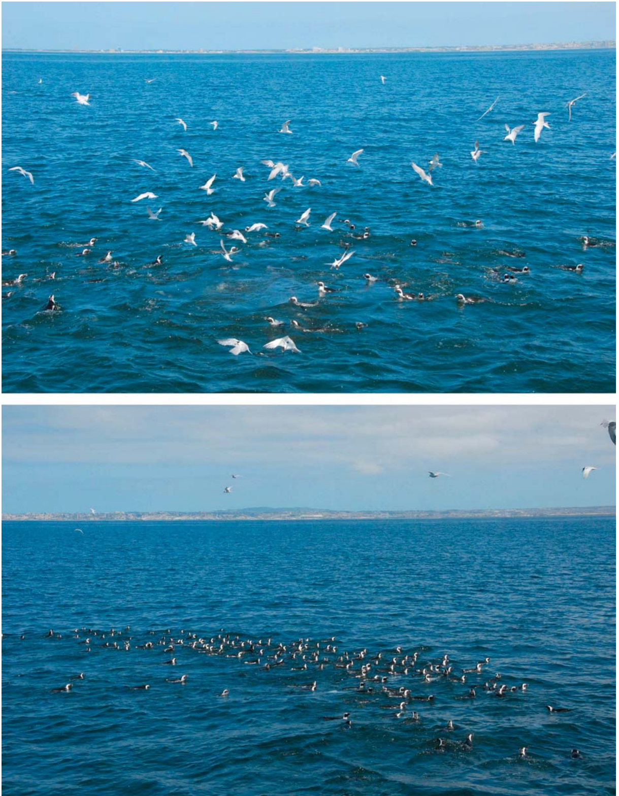
Figure 2. African Penguins circling a school of fish (top) and 2 min later (bottom) after foraging activity ceased, showing roughly three times as many birds resting on the surface (at least 158) than visible while foraging (c. 50).