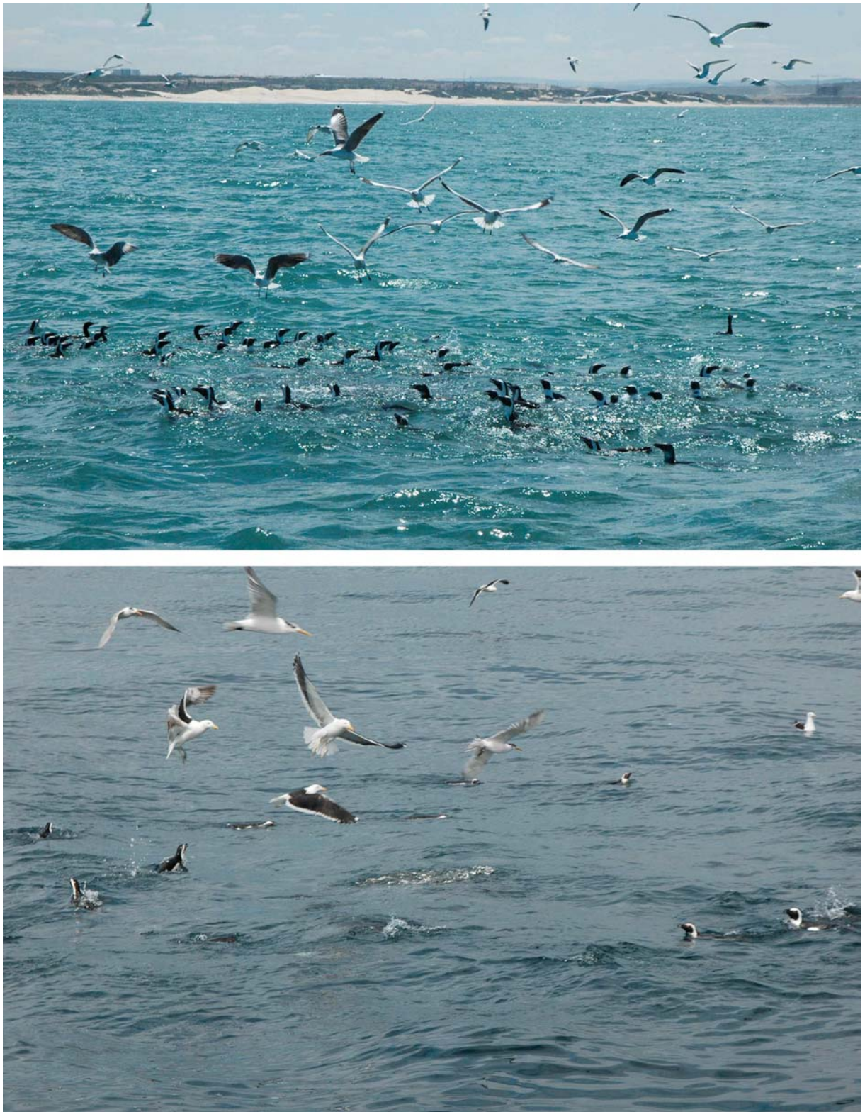
Figure 1. An African Penguin feeding group showing a clear clockwise circling pattern (top) and a smaller group (bottom) that has driven a bait ball of small fish right to the surface (visible as a silver mass in the centre of the picture).