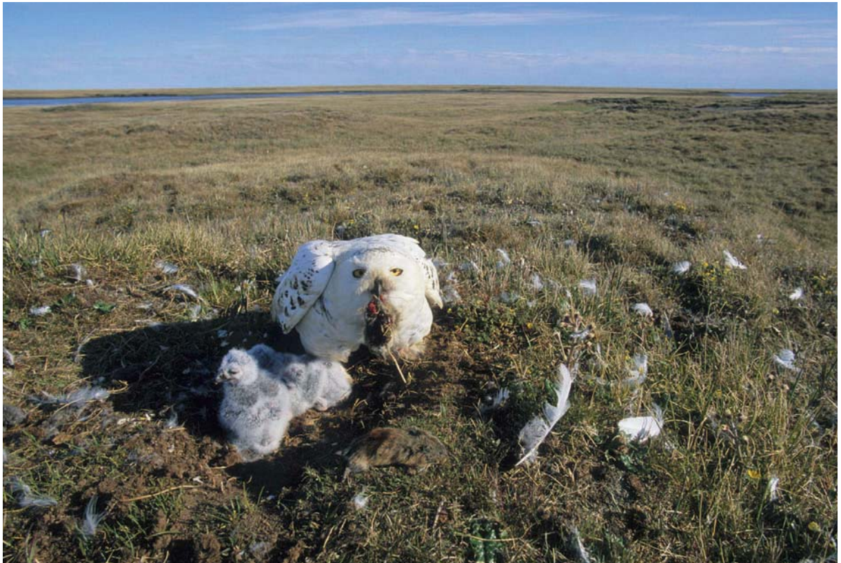
Figure 1. Snowy Owl feeding young at nest, showing use of polygon/mound landscape, Barrow, Alaska.