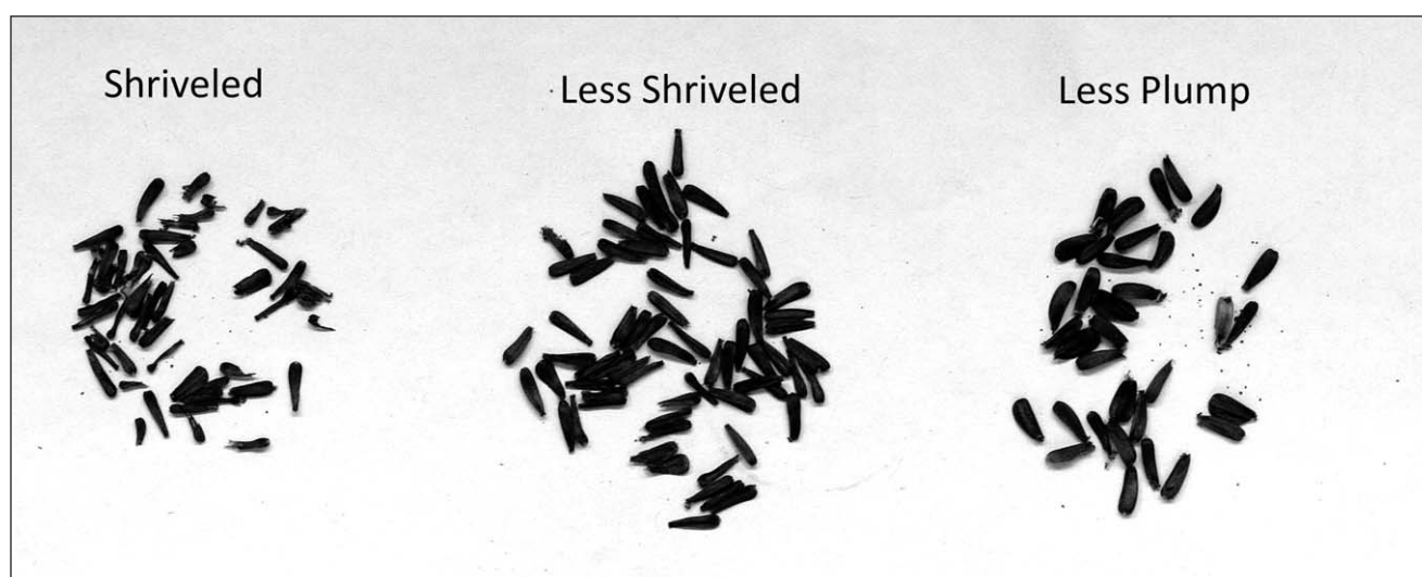
Figure 2. Seed morphological categories. Harvested seeds were separated into four categories according to physical attributes delineating probable viability: shriveled, less shriveled, less plump, and plump. Shriveling was the main characteristic taken into account, along with coloration and the shape of the ends of the seed coat. Shriveled seeds were often discolored brown, while other categories were dark gray. Furthermore, the plumper seeds were, the rounder and more full they appeared.