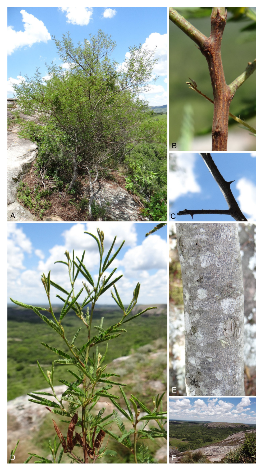
Fig. 1. Morphology and habitat details of Mimosa subinermis . – A: habit and habitat; B: indumentum of old branch; C: aculei; D: leaflets closed at midday; E: trunk; F: habitat. – Brazil, Rio Grande do Sul, Caçapava do Sul, Cerro das Mulas, 11 December 2015; photographs: A–E by D. B. Lucas; F by F. Schmidt Silveira.