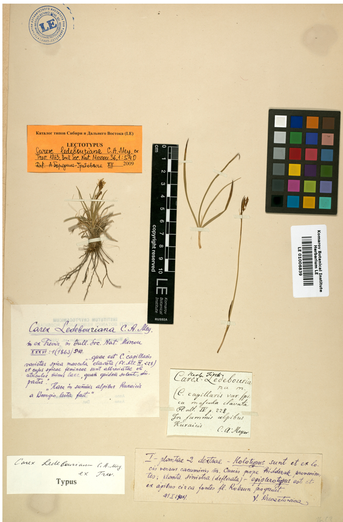
Fig. 2. Original material of Carex ledebouriana : sheet LE 01006839. – A: plant on the left, duplicate specimen of LE 01006840 (Fig. 4); B: two plant fragments of the right, duplicate specimen (isolectotype) of LE 01006841 (Fig. 5).