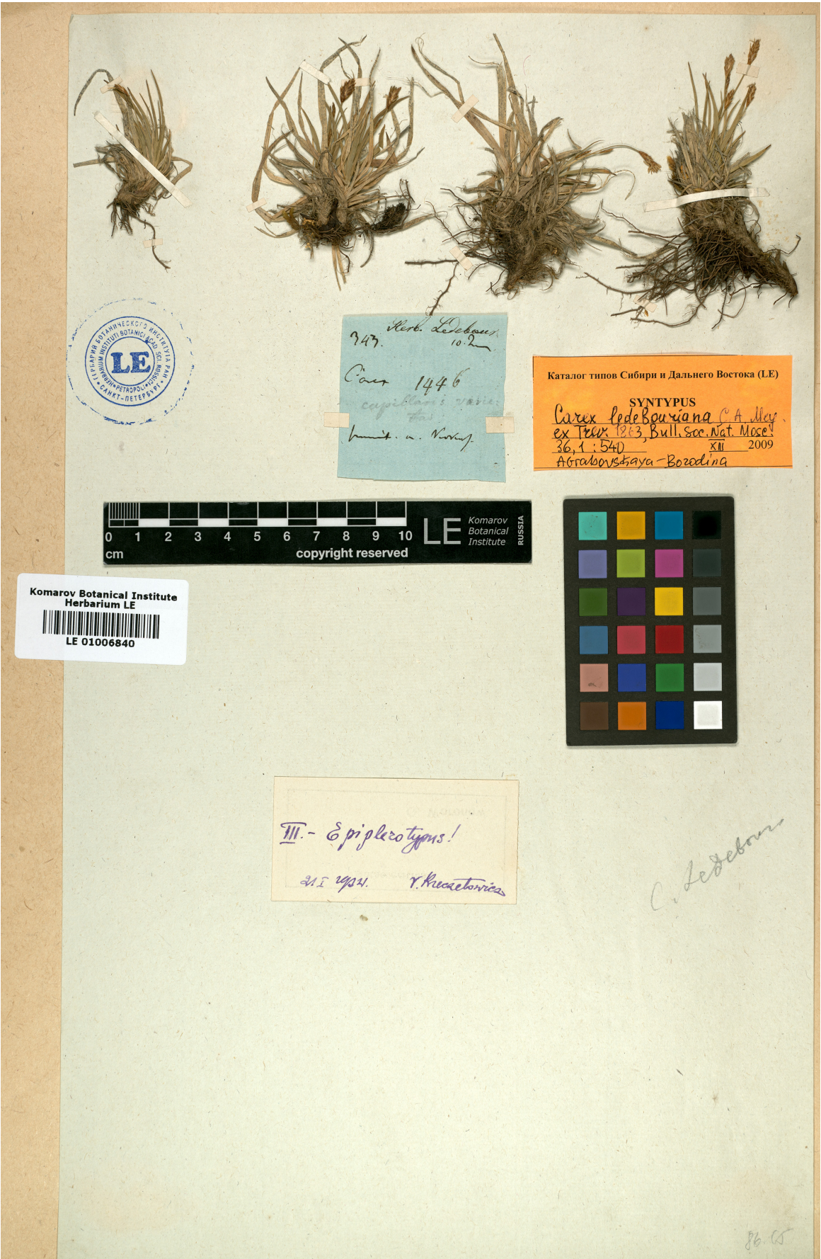
Fig. 4. Original material of Carex ledebouriana : specimen LE 01006840, annotated “Herb. Ledebour / [No.] 343. 10. Jun [1826] / Carex 1446 / Summis in Koksun.”