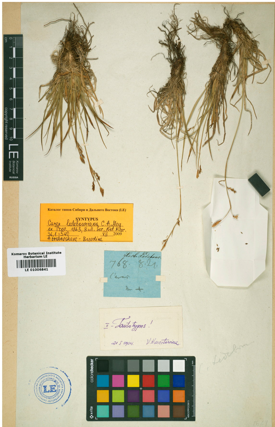
Fig. 5. Lectotype of Carex ledebouriana : specimen LE 01006841, annotated "Herb. Ledebour. / [No.] 768. 8. Jul [1826] / Carex / m[ontis] + [Crucis]."