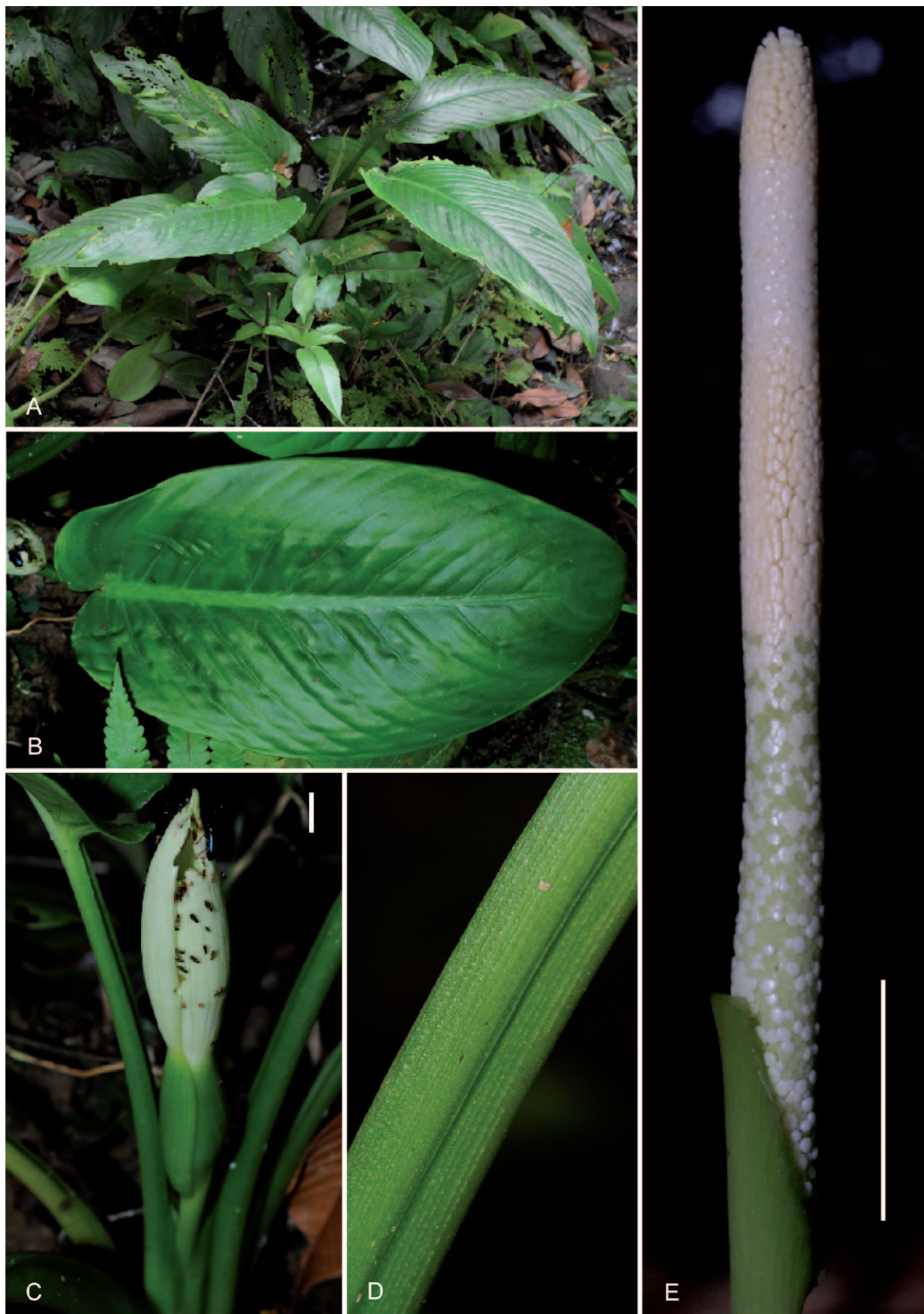
Fig. 2. Schismatoglottis ranchanensis – A: plants in habitat; B: leaf blade; note the conspicuously raised primary venation; C: inflorescence at pistillate anthesis, the inflated spathe limb coincides with the upper part of pistillate flower zone; D: petiole showing the longitudinal ridges and D-shaped cross section; E: inflorescence with spathe artificially removed to reveal the long interstice, c. \frac{1}{4} of the spadix length, and the button-like interstillar staminodes. – Photographs from the type collection; scale bars: C + E = 1 cm.