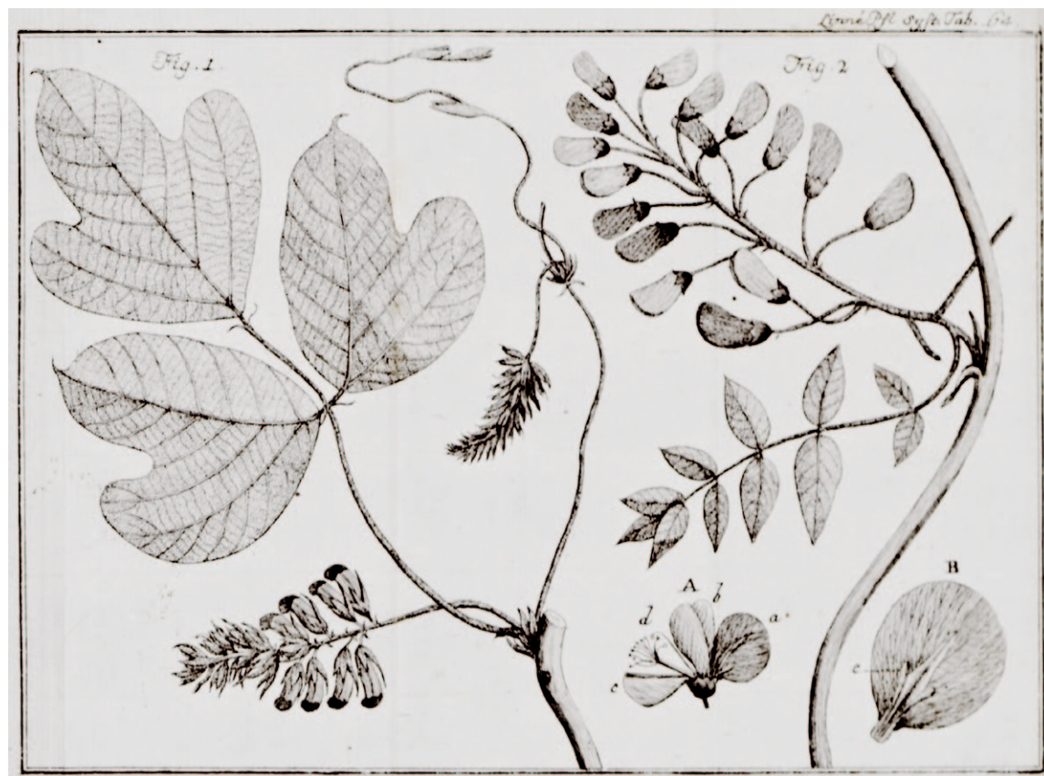
Fig. 8. Wisteria cf. brachybotrys , copper engraving. – From Panzer (1782: t. 64, fig. 2), Berlin, Freie Universität, Botanischer Garten und Botanisches Museum Berlin-Dahlem, Bibliothek.

Gronovius (1743) that he defined Dolichos polystachios L. (Linnaeus 1753). Houttuyn's reference to Gronovius is to D. polystachios in the second edition of the "Flora virginica" (Gronovius 1762). D. polystachios , known colloquially as 'Thicket Bean', is an herbaceous twining bean-like plant with small clusters of purple flowers. It is now recognised as Phaseolus polystachios (L.) Britton & al., bearing little resemblance to any species of Wisteria .