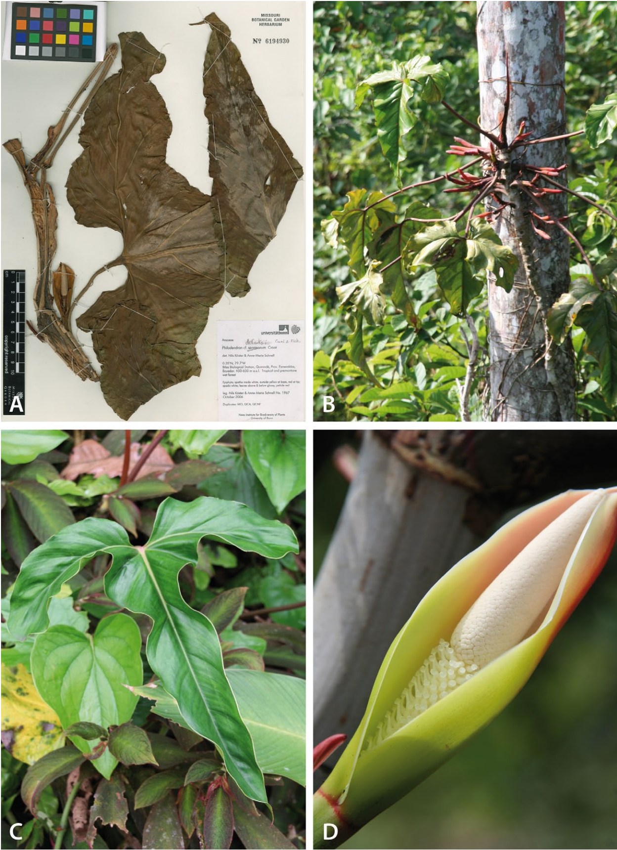
Fig. 1. Philodendron delinksii – A: holotype specimen at MO, Köster & Schnell 1967; B: habit of specimen at type locality, Ecuador, Esmeraldas, Bilsa Biological Station; C: leaf of specimen at type locality, Ecuador, Esmeraldas, Bilsa Biological Station; D: fresh inflorescence of type collection, Köster & Schnell 1967. – Photographs by C. Kostelac (A) and N. Köster (B–D).