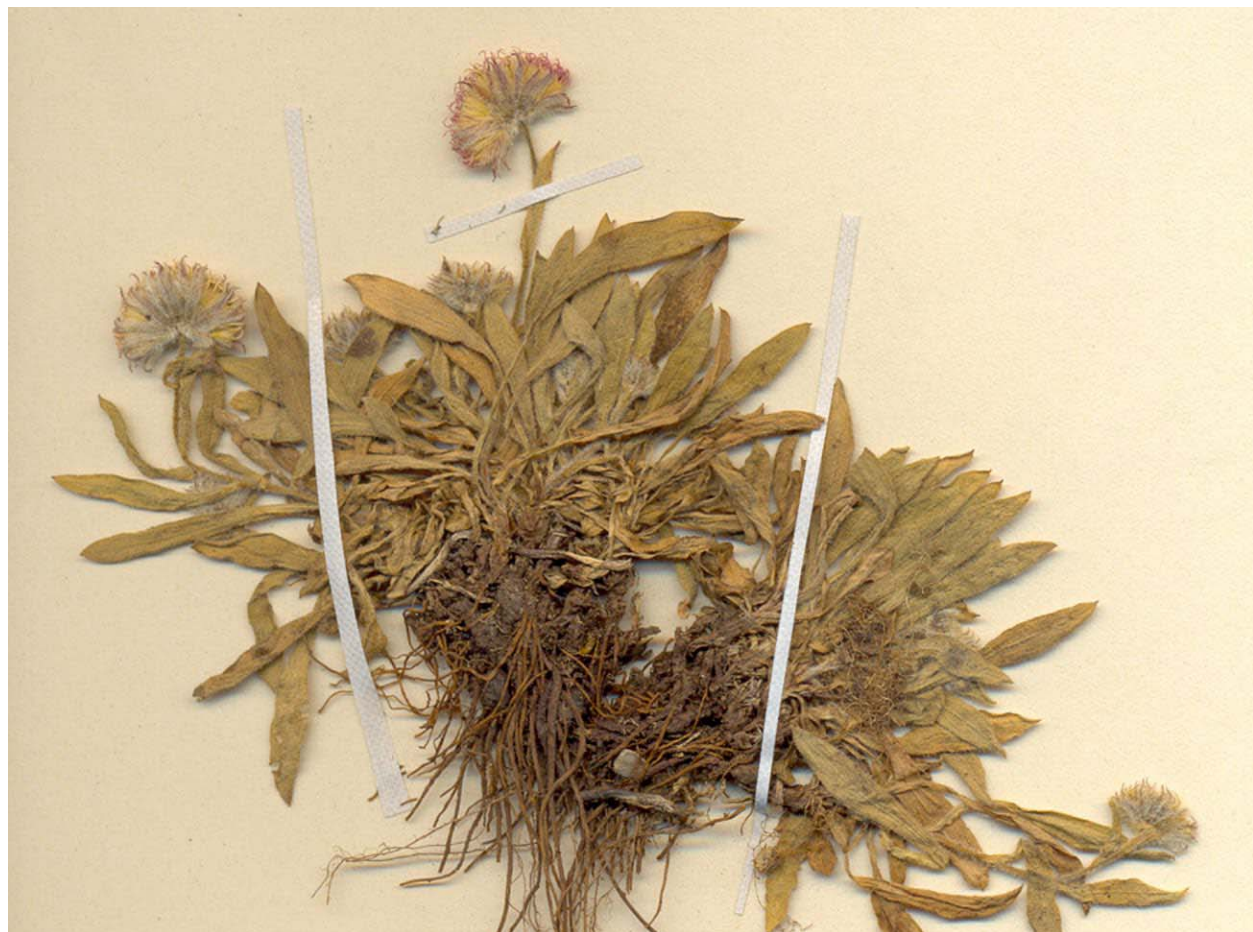
Fig. 1. Erigeron uniflorus subsp. parnassensis , holotype specimen.

nal collectors (C. D. Preston, pers. comm., 2007), there is no suggestion that the plants were collected from an unusual habitat or substrate, where conditions of stress might induce phenotypic modification.