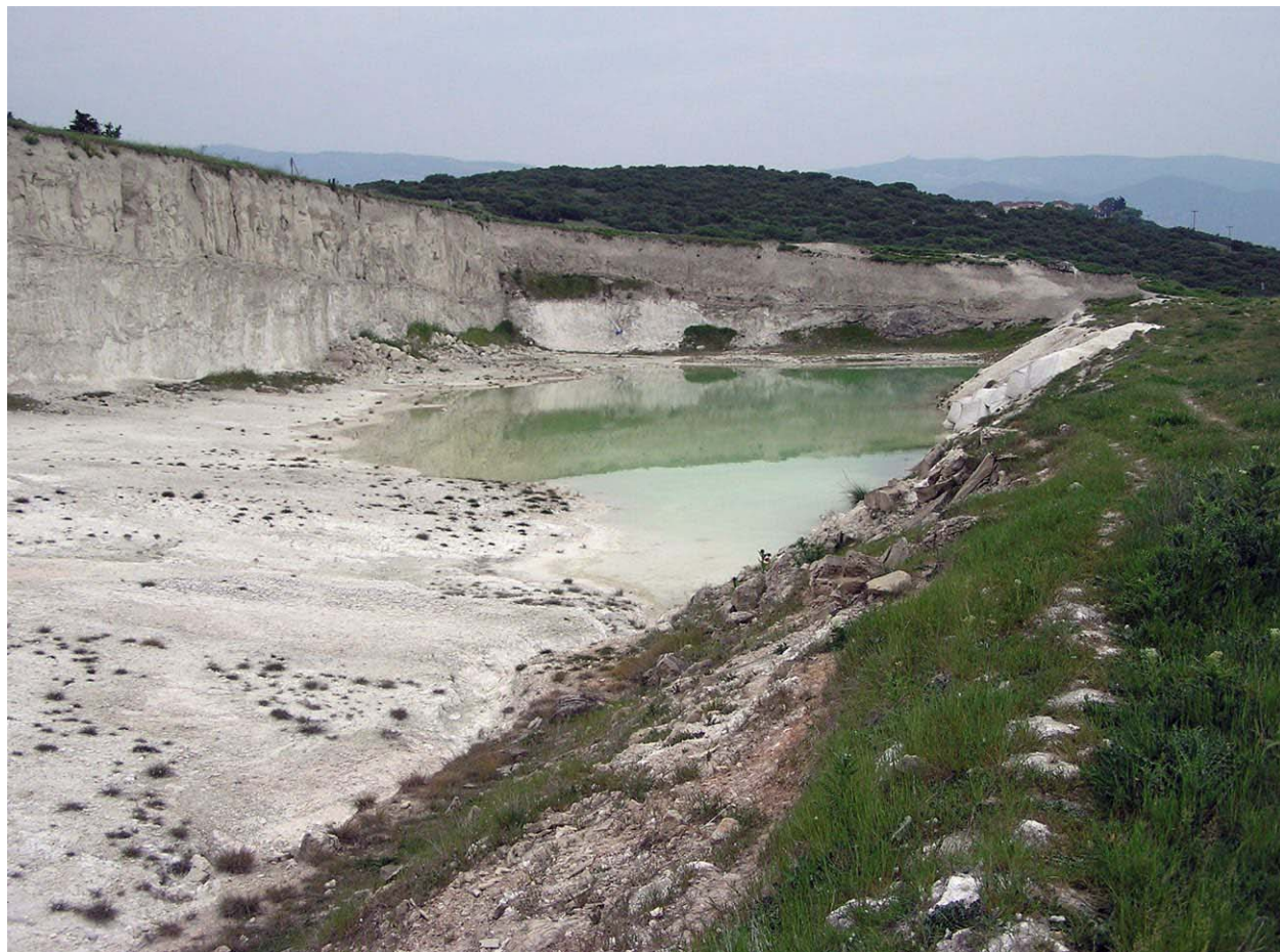
Fig. 3. Habitat of Puccinellia bilykiana in Greece.