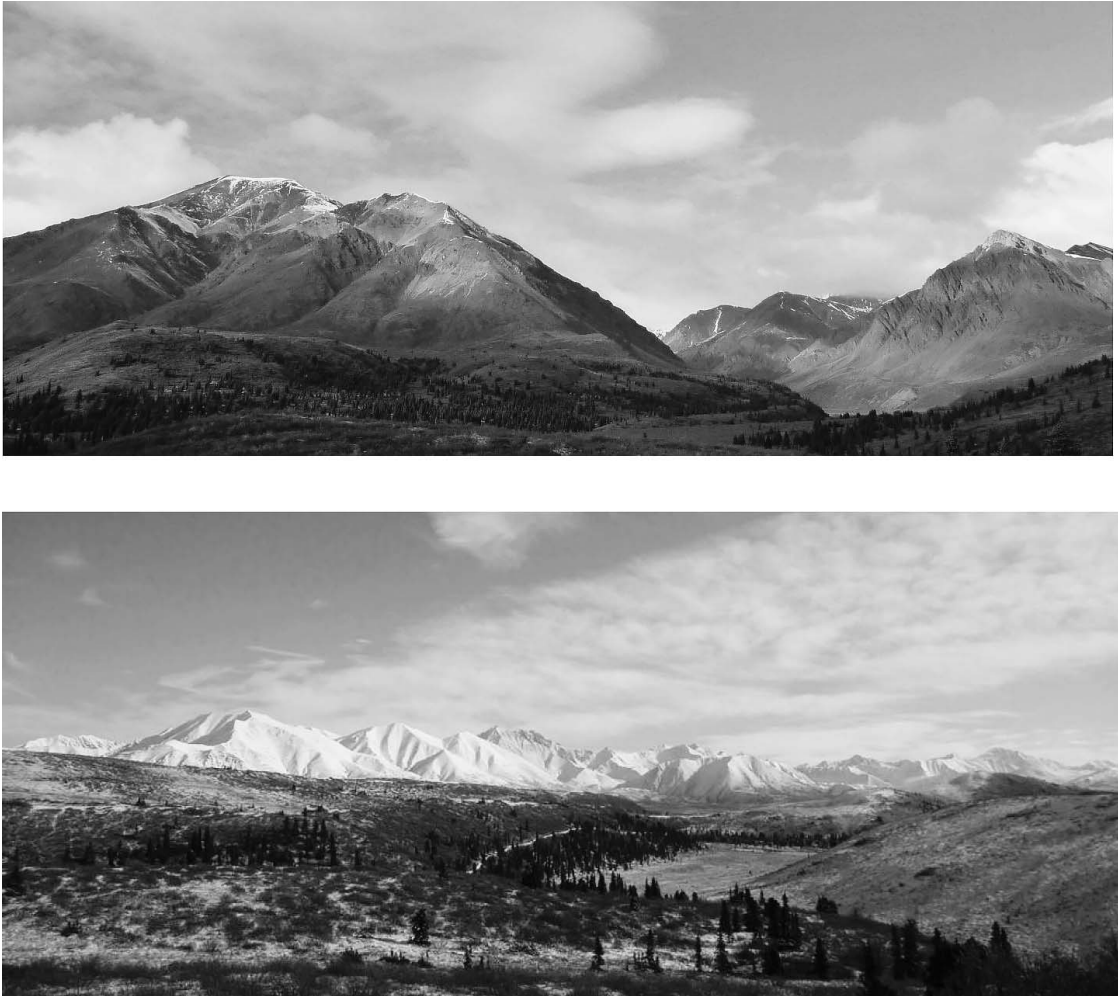
Figure 3. View looking to the northwest (top) and northeast (bottom) from an autumn observation site near Lost Creek on the southern slopes of the Mentasta Mountains, October 2014. In autumn, most Golden Eagles were detected as they migrated along the higher ridges of the Mentasta Mountains to the north of the observation site.

low along slopes or circling low over the landscape) and 91 appeared to be primarily intent on migrating. We did not observe any white feathering on most of the eagles we detected in spring 2014.