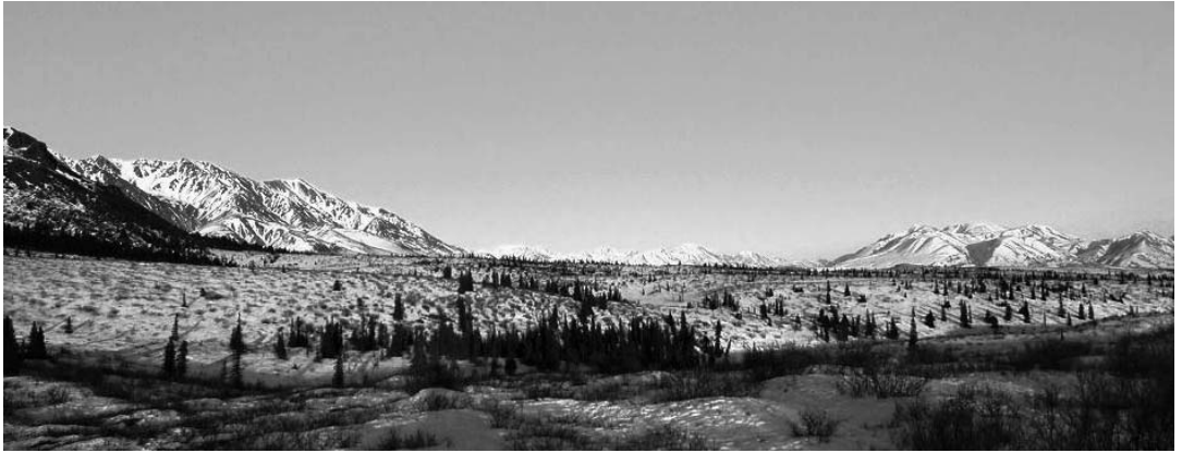
Figure 2. View looking east from a spring observation site near Rock Creek on the southern slope of the Mentasta Mountains, March 2014. In spring, migrating Golden Eagles were detected across a broad front, from the Mentasta Mountains to the north (left side of photo) to the Boyden Hills to the south (right side of photo).

capture work (5 d from an east-facing blind, 17–21 March, and 5 d from a west-facing blind, 23–27 March), and while we dismantled our field camp and trapping sites (1 d; 28 March).