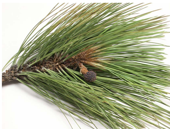
FIG. 2. Branchlet with non-binary strobili in Jeffrey pine collected in Sequoia National Park. The total length of the strobili was 38 mm.

The total length of the strobilus was 38 mm, with the distal female portion 12 mm long and the proximal male portion 14 mm long (Fig. 2). The diameter at the base of the male portion was 14.5 mm and was thicker (7.3 mm) relative to a wholly male strobilus, similar to that reported in Dickson (1860) and others. The stem was 12 mm in length and 6.2 mm diameter at its base. The female portion was of the same