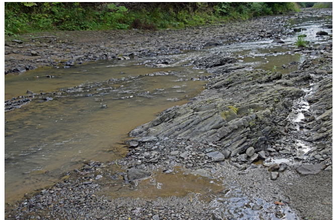
Fig. 4: Locality of Prinerigone vagans (Audouin, 1826), Istebna, Bank of river Olza, Poland

Prinerigone vagans has been frequently found in Great Britain, France, Germany and the Benelux (Le Peru 2007, Tutelaers 2012, Arachnologische Gesellschaft 2017, British Arachnological Society 2017), and records exist from nearly all European Mediterranean countries (Nentwig et al. 2017), but the species seems to be rare in the Czech Republic, from which only two localities are known (Czech Arachnological Society 2017). Our single male was found in a typical habitat, which supports the hypothesis that (at least along the river Olza) Polish populations of the species exist. The species is probably absent from Scandinavia (except Denmark, Vangsgård et al. 1997) and other northern parts of Eastern Europe (Nentwig et al. 2017). It seems to be widely distributed in North Africa (Audouin 1826, Jocqué 1981, Bosmans 2007) and the Near East through to Iran (Pickard-Cambridge, 1872, Tanasevitch 2009). Interestingly, P. vagans is considered as the most common linyphiid in the Maghreb by Bosmans (2007). Other records were made, e.g., in Chinese parts of Central Asia (Zhou et al. 1983) and Marion Island in the southern Indian Ocean (Lawrence 1971).