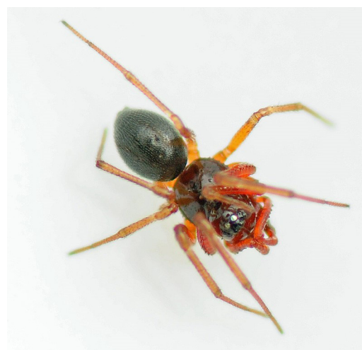
Fig. 1: Live male of Prinerigone vagans (Audouin, 1826) from Poland, dorsal view

Material. POLAND, Silesia, The Silesian Beskids mountain range, Istebna, bank of the river Olza, 49.57397° N, 18.90317° E (WGS 84), 1♂, 552 m a.s.l., collected by hand, 16.viii.2015, leg. Luis Guttenberger.