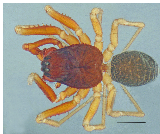
Fig. 2: Male of Prinerigone vagans (Audouin, 1826) from Poland, dorsal view (Scale line = 0.5 mm)