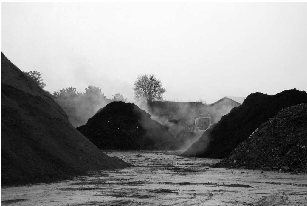
Figure 4. Thermal mist rises from compost heaps at AFLD Easterholt.

weeds and the eggs of exotic, Iberian slugs ( Arion vulgaris ) are said to perish at 70 degrees Celsius. Weeds and trash animals, such as slugs, are pests in the eyes of private gardeners, who are the intended end-users of the mulch produced. Only a slug-free mulch can become a product. Armed with thermometers at the end of meter-long metal rods, the operators of the bulldozers prod the compost mounds to ascertain when to ventilate them, leveraging bacterial production to exterminate the slugs.