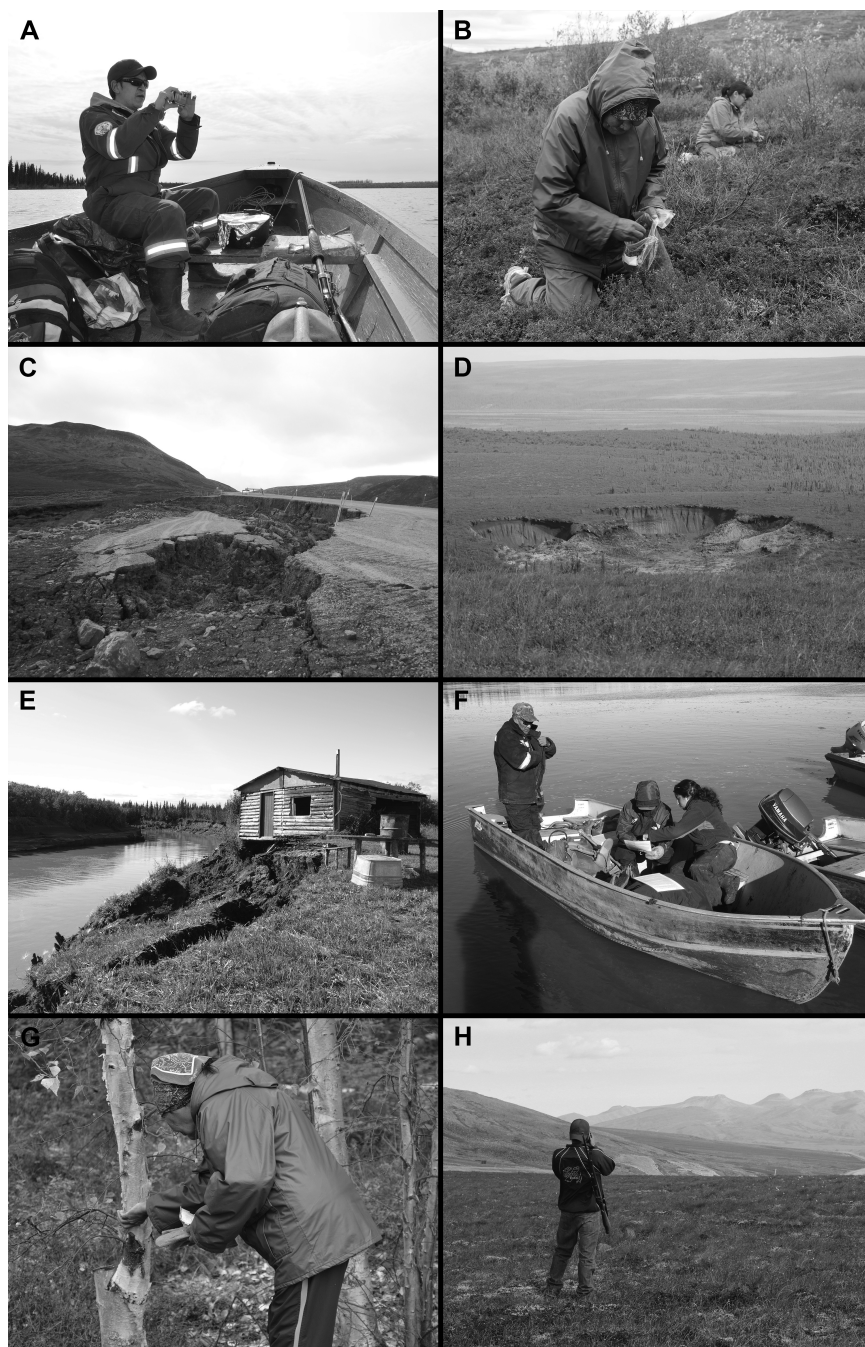
Figure 2. Photographs taken during participatory multimedia mapping of environmental conditions in the lower Peel River watershed, Northwest Territories: (A) Herbie Snowshoe using video to document ice conditions on the Peel River (May 2012); (B) Wanda Pascal and Emma Kay observing and collecting Labrador tea near the Yukon-Northwest Territories border (September 2012); (C) erosion of the Dempster Highway associated with