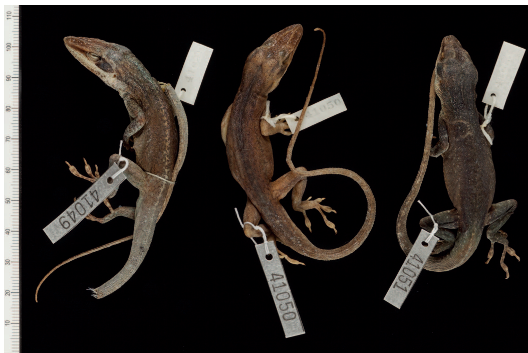
Fig. 1. Anolis carolinensis collected on 7 Mar 1950 in Kaimuki, Honolulu, Oahu, Hawaii (SDNHM 41049–41051), all males; Note the presence of dark postorbital spots, light flank spots (rather faint in SDNHM 41050) and a middorsal light stripe (only in SDNHM 41049). Scale in millimeters.