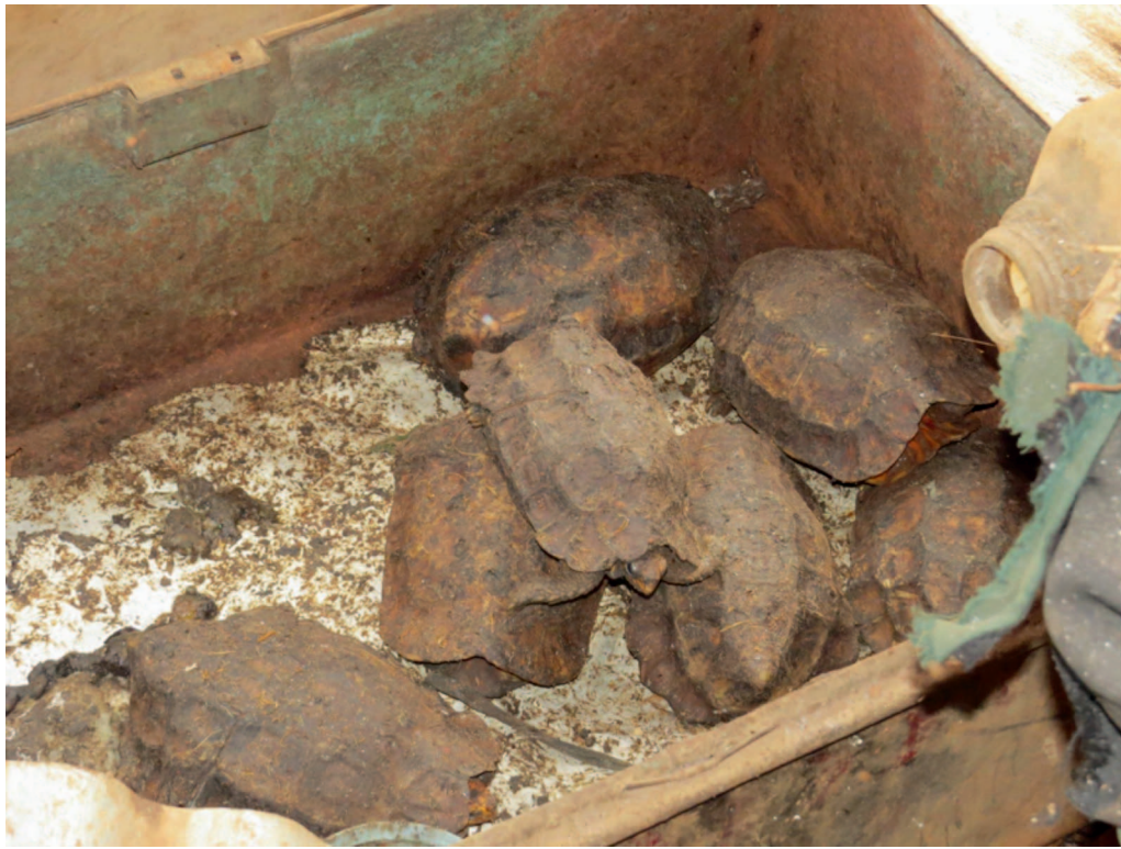
Figure 3. A cage containing several wild individuals of Kinixys homeana , captured in the surroundings of Calabar (Cross River State, Nigeria). According to the traders, forest tortoises are dispatched illegally to Benin and then exported “legally” with CITES certificates. (Color version is available online.)

We also showed that the international trade of CITES-listed turtles has grown tremendously over the years, increasing over about 2 decades from about 50,000 to over 150,000 individuals annually traded. Consistently with our estimates, CITES (2016) reported, for the years 2011–2014, an average of 138,000 live wild-collected CITES-listed tortoises and freshwater turtles per year. In the same period, the total estimated turtle trade (either CITES-listed or nonlisted, both wild-collected and farmed) is over 8 million turtles annually, thus revealing the huge size of the turtle trade across the earth. Also in this case, the data concerning turtles are in agreement with patterns observed on the pythons, with an overall tripling of trade volume in the most frequently traded species (such as Python reticulatus ; Luiselli et al. 2012). We suggest that further studies should be carried out to understand whether noticeable declines of wild turtles are attributable to the international pet trade (as well as for consumption purposes), especially in the Asian region where the consumption of turtle meat has already been demonstrated to be unsustainable (van Dijk et al. 2000; Turtle Conservation Fund 2002; Gong et al. 2009).