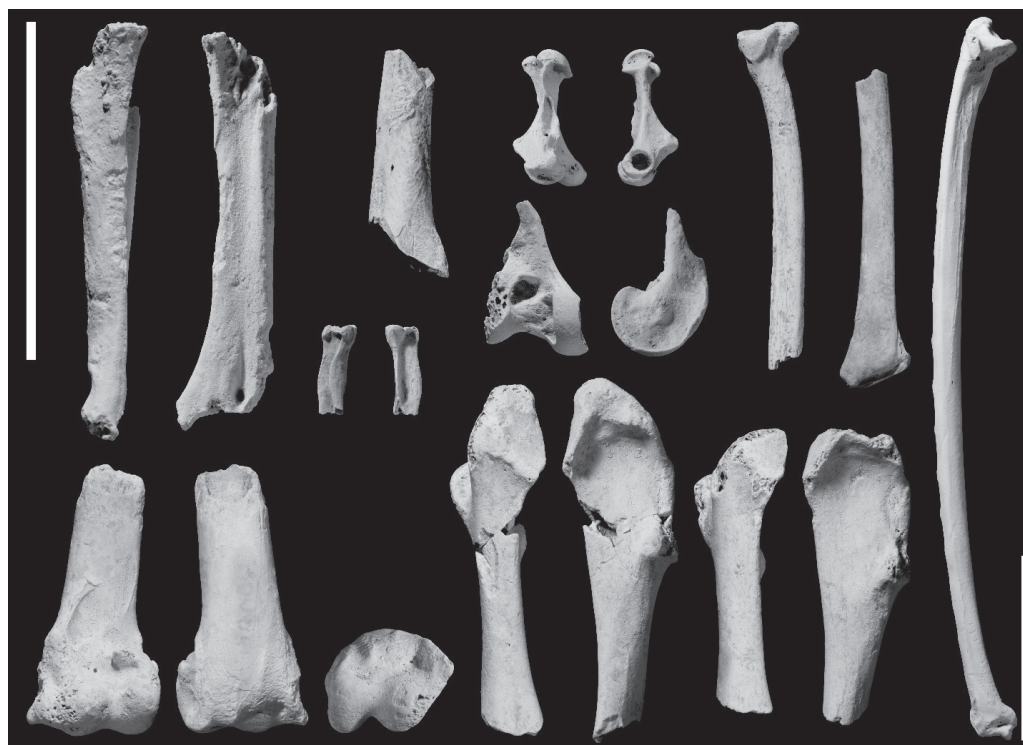
Figure 9. Osteological specimens of Spectacled Cormorant Urile perspicillatus in the National Museum of Science and Nature, Tsukuba Research Centre, Tsukuba, Japan (NSM PV 24191); note the differing scale for the ulna (right; both scale bars equal to 50 mm)

Fossil material from Pleistocene deposits around Shiriya, Japan was collected in the 1970s and identified as various cormorant specimens in the 1980s. The materials were rechecked by Watanabe et al. (2018) and found to contain 13 elements of Spectacled Cormorant (NSM PV 24191 and others; Fig. 9) indicating a much wider historical distribution for the species.