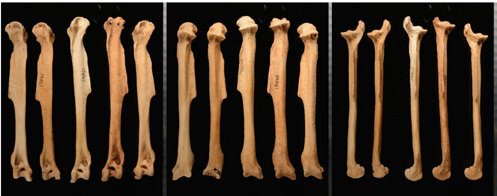
Figure 13. Tibiotarsi from Spectacled Cormorants Urile perspicillatus in the National Museum of Natural History, Washington, DC (USNM 17041); scale bars in mm