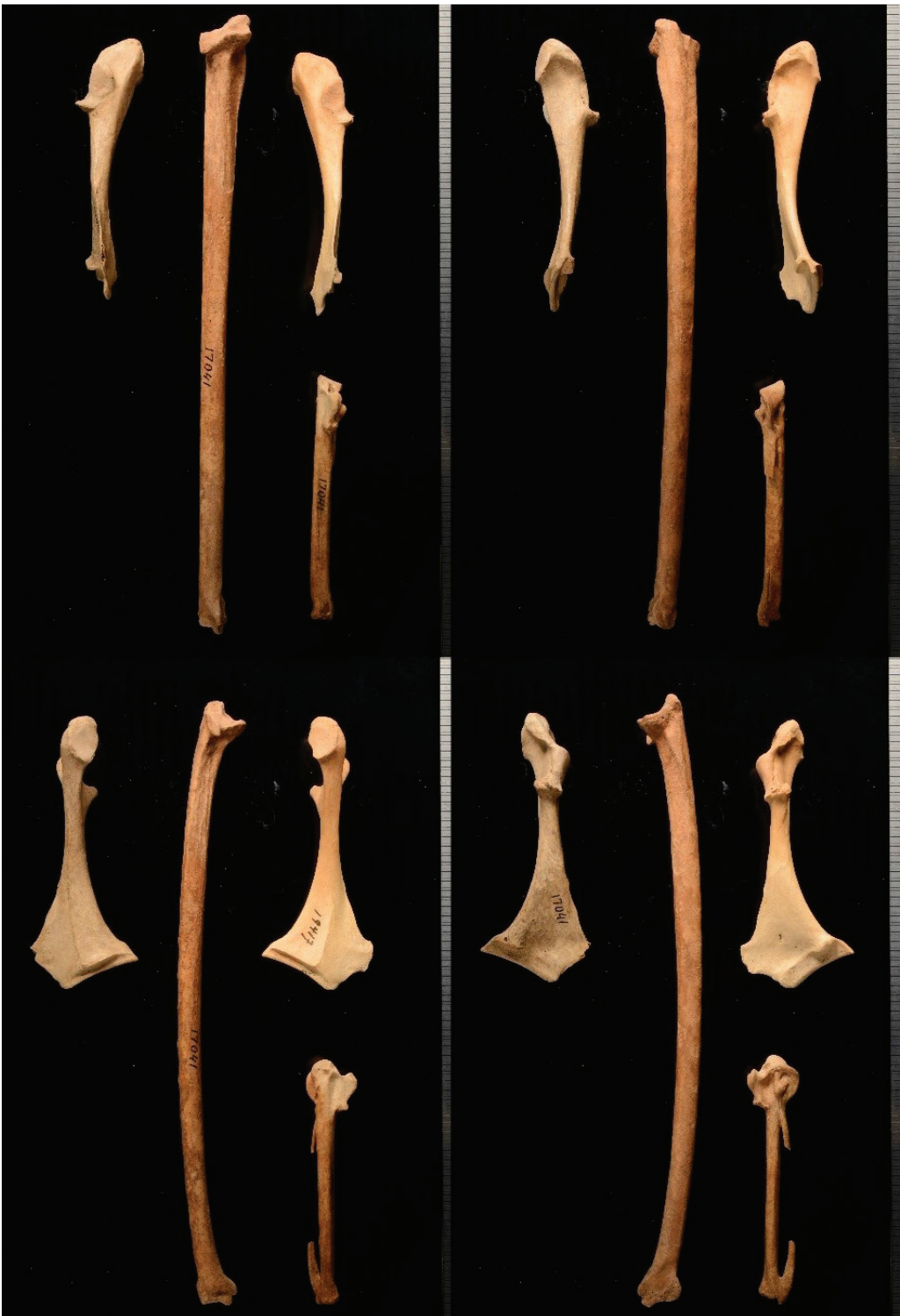
Figure 11. Left and right coracoid, carpometacarpus, and ulna from Spectacled Cormorants Urile perspicillatus in the National Museum of Natural History, Washington, DC (USNM 17041 and USNM 19417); scale bars in mm