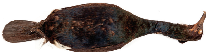
Figure 8. Unmounted skin of Spectacled Cormorant Urile perspicillatus in the Natural History Museum, Tring (NHMUK 1858.2.3.1)