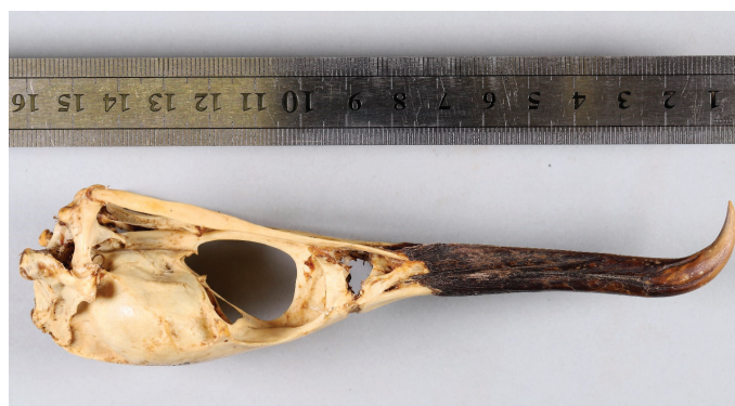
Figure 6 (left and below). Detailed photographs of Spectacled Cormorant Urile perspicillatus skull and mandible in the collection of the Zoological Institute of the Russian Academy of Sciences, St Petersburg (ZISP 1112)