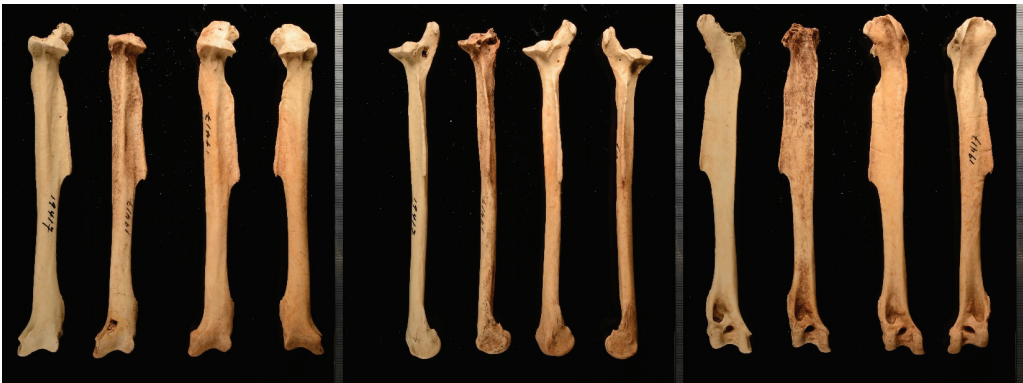
Figure 14. Tibiotarsi from Spectacled Cormorants Urile perspicillatus in the National Museum of Natural History, Washington, DC (USNM 19417); scale bars in mm