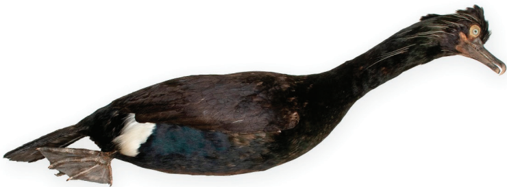
Figure 3 (top). Spectacled Cormorant Urile perspicillatus skin in the collection of the Zoological Institute of the Russian Academy of Sciences, St. Petersburg (ZISP 137178)