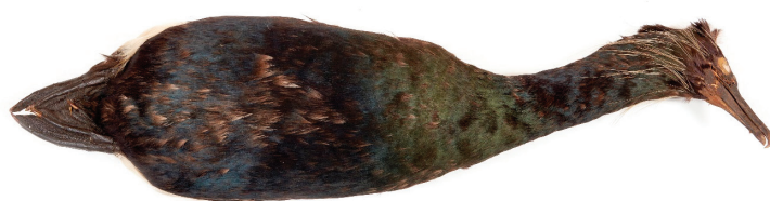
Figure 7. Unmounted skin of Spectacled Cormorant Urile perspicillatus in the Natural History Museum, Tring (NHMUK 1842.12.21.4)