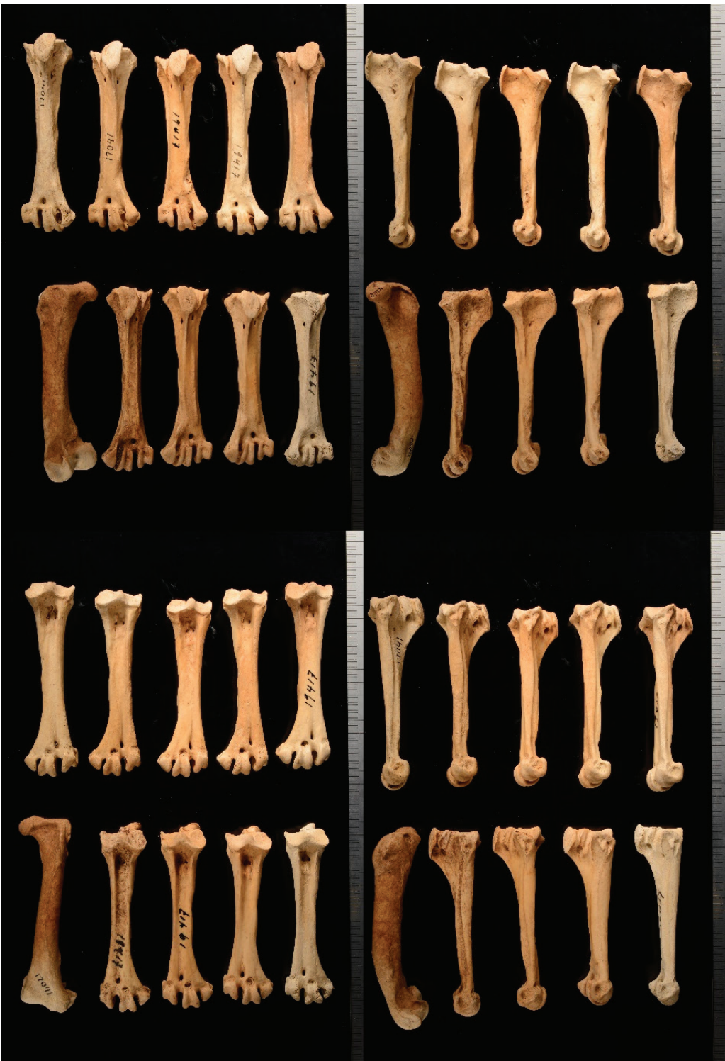
Figure 12. Femur and tarsometatarsi from Spectacled Cormorants Urile perspicillatus in the National Museum of Natural History, Washington, DC (USNM 17041 and USNM 19417); scale bars in mm