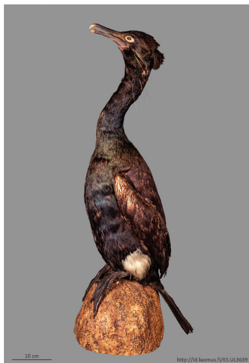
Figure 1. Spectacled Cormorant Urile perspicillatus mount at the Finnish Museum of Natural History, Helsinki (MZH UK 3639) (© P. Malinen; full record at http://id.luomus.fi/GZ.18079 ).

According to Palmgren (1935) the skin held in Helsinki (MZH UL 3639; Fig. 1) was either acquired directly by naturalist Reinhold Ferdinand Sahlberg (1779–1860) during a trip to Sitka between 13 May 1840 and 15 May 1841 (Palmgren 1935) or via the Zoological Institute of the Russian Academy of Sciences (Neufeldt 1978). Sahlberg reportedly had good relations with