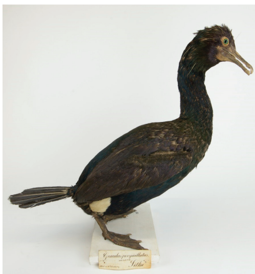
Figure 2. Spectacled Cormorant Urile perspicillatus mount at the Naturalis Biodiversity Center, Leiden (RMNH.AVES.107865)

This specimen (RMNH.AVES.107865; Fig. 2) was received from the Zoological Institute of the Imperial (now Russian) Academy of Sciences in the mid-1800s and noted to have origins in Sitka (Schlegel 1863), but the circumstances of its receipt are unclear and nothing is known of its arrival in Europe (P. Kamminga in litt. 2022). What appears to be an original specimen tag notes both the museum in St. Petersburg and the town of 'Sitka' (as opposed to Novo-Arkhangelsk or New Archangel) as origins of the skin, however because the transfer happened before Russian Alaska became part of the USA this may have been an updated tag from some time afterwards. Later publications concur in this specimen being a transfer from the Russian Academy of Sciences (see below; Stejneger & Lucas 1889, Hume 2017). The specimen is mounted upright on a raised white wooden board and appears in fair shape with some clear discoloration all over. The occipital crests are essentially indistinguishable. The bill appears particularly frail and the tail feathers are worn.