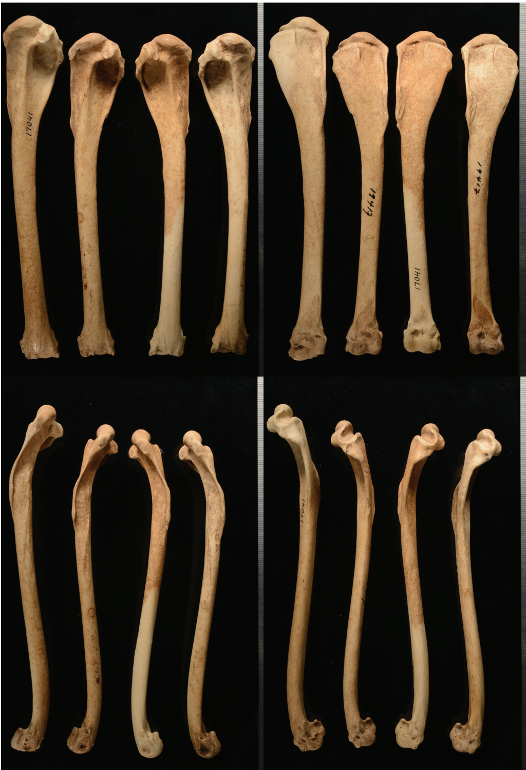
Figure 10. Humeri from Spectacled Cormorants Urile perspicillatus in the National Museum of Natural History, Washington, DC (USNM 17041 and USNM 19417); scale bars in mm