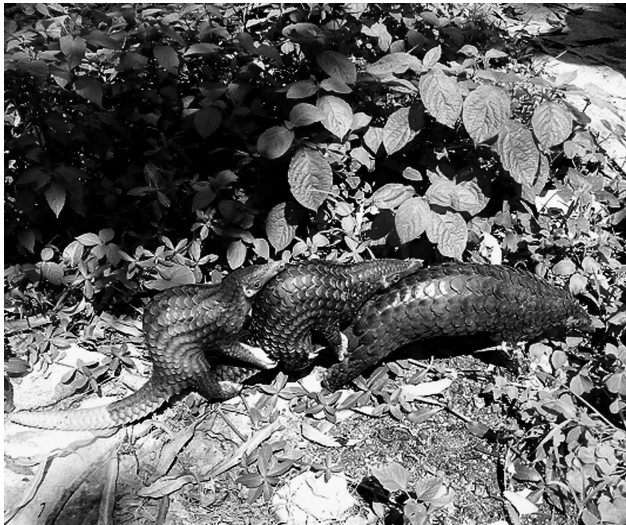
Fig. 2. This picture shows two young riding on the tail of a female Sunda pangolin – suggesting it gave birth to twins (by Shibao Wu in 2009).

for mating. At irregular intervals, their sexual responses were observed and when it was suspected mating had occurred the female was housed individually.