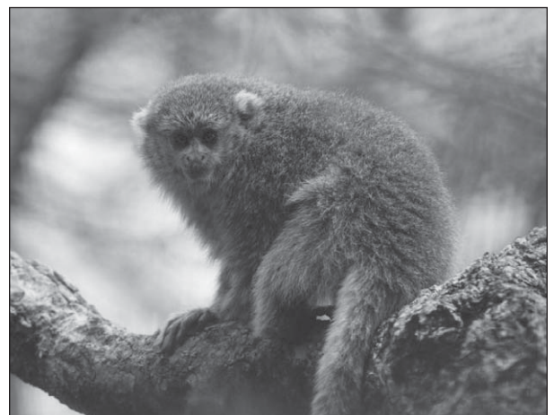
Figure 6. C. donacophilus near Santa Cruz city (#32)