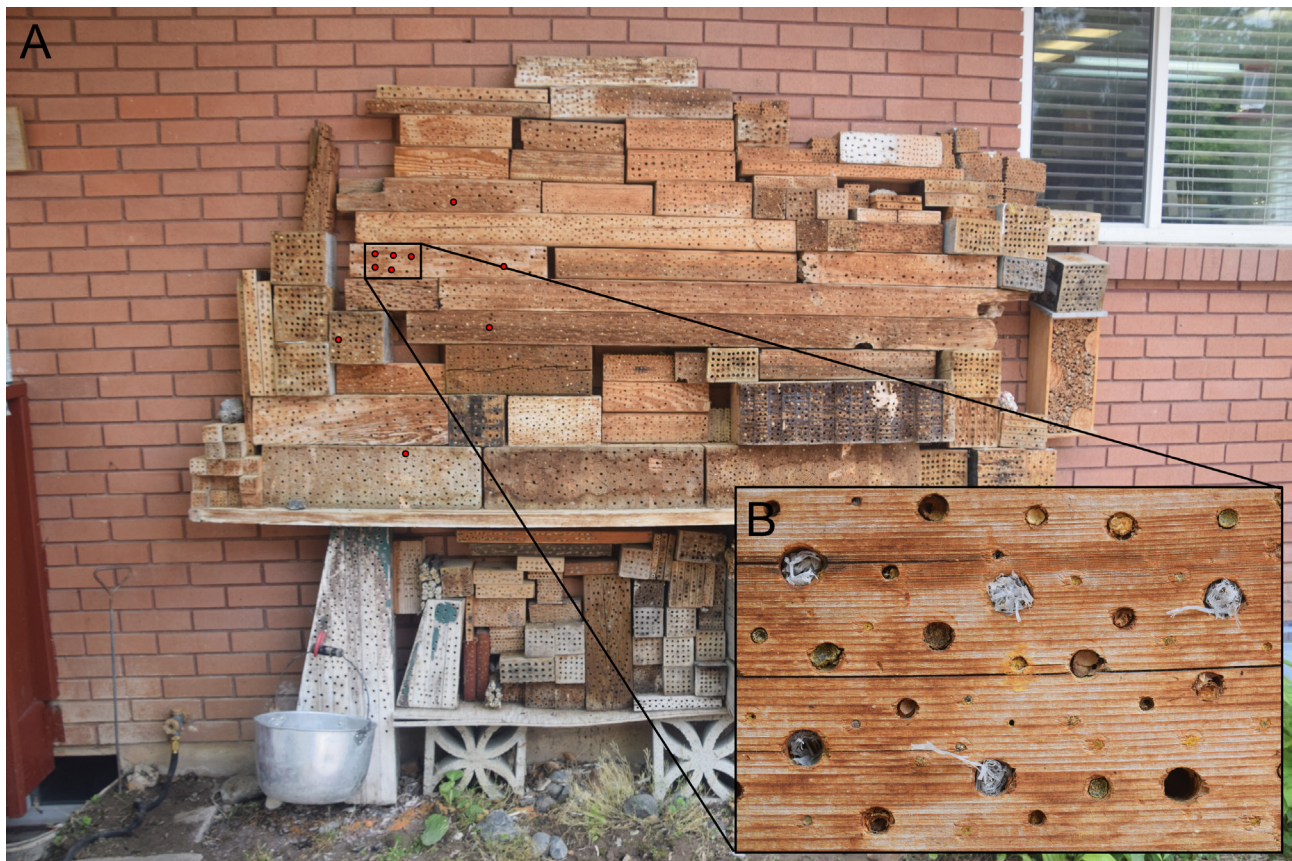
Fig. 1. Trap nests where use of plastic for nesting by Isodontia elegans took place. A. The trap nests set up in FDP's backyard, with the ten plastic fiber nests marked in red. B. Close-up view of a nest closure made with plastic fibers.

a wide variety of vegetables and flowering trees that house all manner of insects. A series of trap nests of highly variable sizes in irregular formation is also present (Fig. 1A), ranging in diameter from 2 mm to over 1 cm and numbering well into the hundreds. Over a period of about two weeks inclusive of July 23–26, 2021, at least two females of Isodontia elegans were observed provisioning nests in ~9 mm diameter trap nest holes with what seemed to be exclusively Oecanthus fultoni Walker (Orthoptera: Gryllidae), then sealing the nests with an unusual plastic material, sometimes forming apical brooms as they normally do with grass (Fig. 1B, Supplementary Video 1). The source of the material was discovered directly over the fence of FDP's backyard, roughly 7 m from the nests, and identified as a green, friable bag made of interwoven plastic fibers used to house and carry various heavy building materials (possibly sought because very little grass was present in the backyard of FDP). In total, ten nests were provisioned in 2021 (Fig. 1A), only one of which had some grass visible in the closure. The site was visited by both authors for imaging in mid-June 2022, but no wasp activity was evident. Based on the partial excavation of one