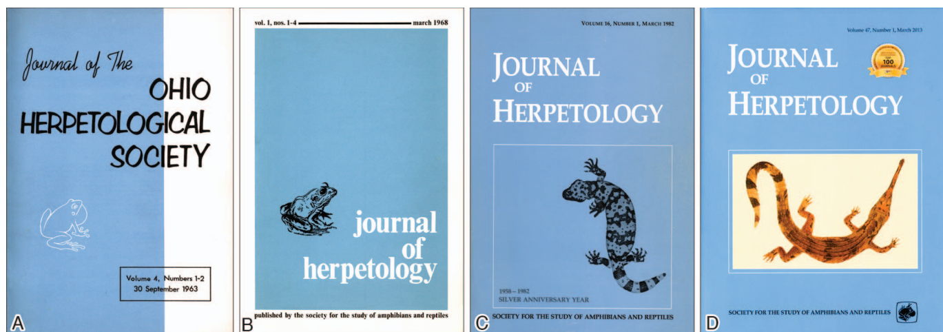
FIG. 3. Re-designed issues of the society's scientific journals. (A): Cover of major re-designed Journal of The Ohio Herpetological Society (vol. 4, nos. 1–2, September 1963); enlarged issue (64 pages in length and 7 \times 10 -inch format) with new society colors and frog logo. (B): Cover of first volume of Journal of Herpetology (vol. 1, nos. 1–4, March 1968 [published April 26]), new cover design but with same elements. (C): Modern journal format established (vol. 16, no. 1, March 1982); new cover design as well as text pages. (D): Page dimensions of journal increased to 8.5 \times 11 inches in 2011 (the current format size). This image of Tomistoma schlegelii appeared on all of the 2013 covers.