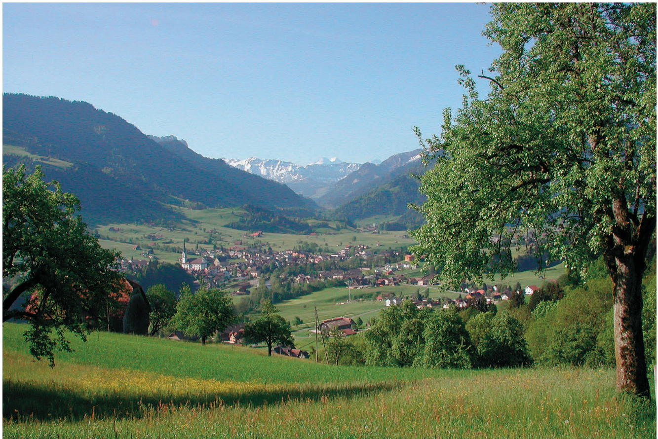
FIGURE 2 Schüpheim, the main settlement of the UNESCO BRE, with the first alpine chains in the background.