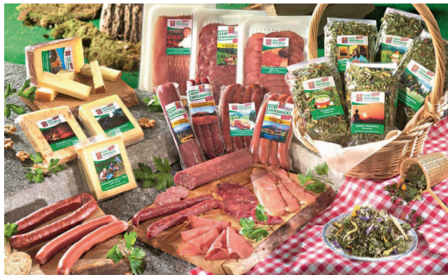
FIGURE 4 A selection of labeled products sold in supermarket chains in Switzerland.