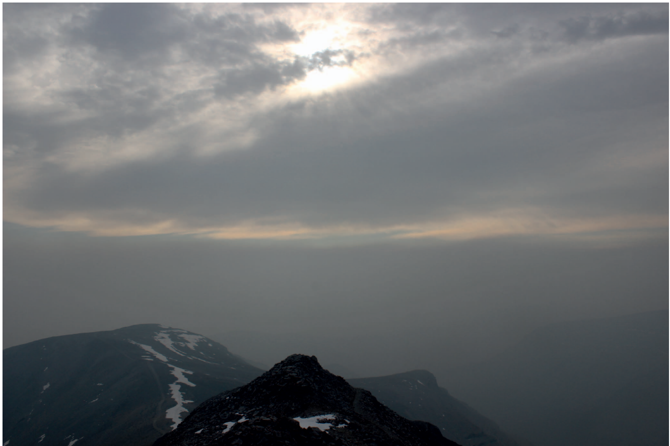
FIGURE 4 View from a mountain lookout with visibility reduced to 1 km by wildfire smoke from Washington State Okanogan fire, August 2015.

events. Lookout observers offer a unique perspective on wildfires, experienced predominantly as smoke. This experience extends to communities in the mountains and beyond who might similarly experience wildfires at a distance, and it contributes to thinking about experience at the periphery of wildfires, and extreme weather events more broadly.