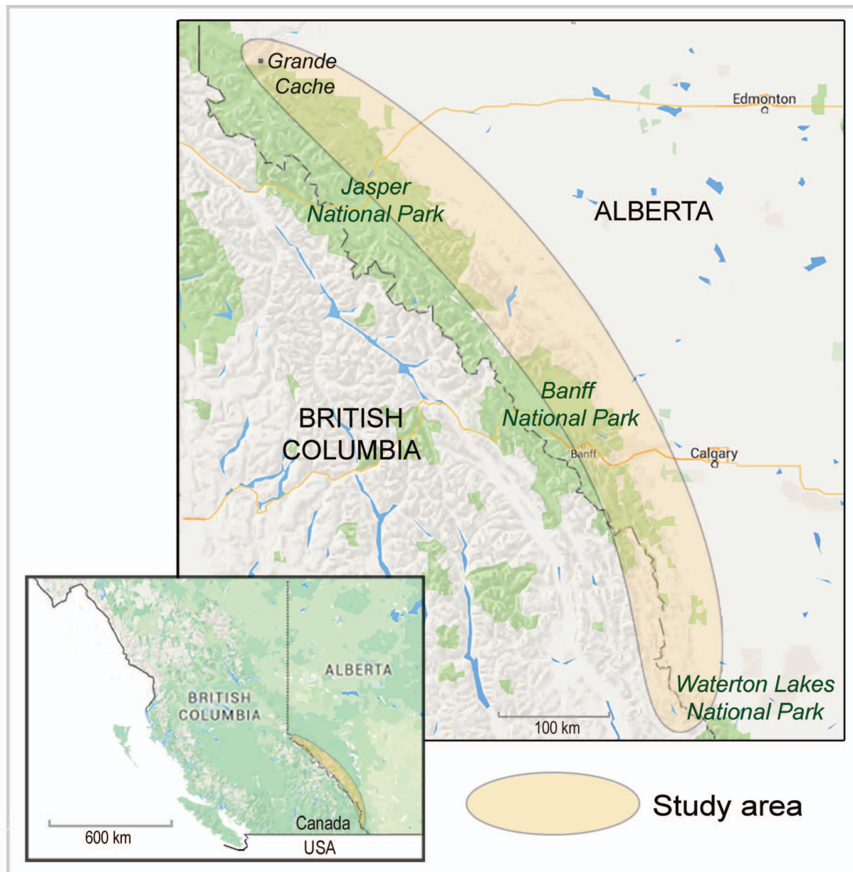
FIGURE 1 Map of the study area in detail and context. This map outlines the study area along the eastern slopes of the Alberta Rocky Mountains from Grand Cache in the north to Waterton Lakes National Park (along the border with the United States) in the south ( 113^{\circ}39'36'' – 119^{\circ}12'36'' W; 49^{\circ}0'0'' – 53^{\circ}58'12'' N). (Base map data © 2016 Google; map by Mary Sanseverino)

One of us (K.A.W.) conducted open-ended, semistructured interviews with lookout veterans with 20 years of experience or more ( n = 10 ), with lookouts who had less than 20 years of experience ( n = 4 ), and with retired lookouts ( n = 2 ). In total, 4 to 5 hours were spent at each lookout, where informal conversations, photo elicitation, and participant observation complemented the interviews. Two weeks of additional participant observation (Dewalt and Dewalt 2011) was conducted at 2 lookouts at the end of the field season. Living at the lookout, one of us (K.A.W.) adopted the role of an apprentice, observing and participating in daily lookout