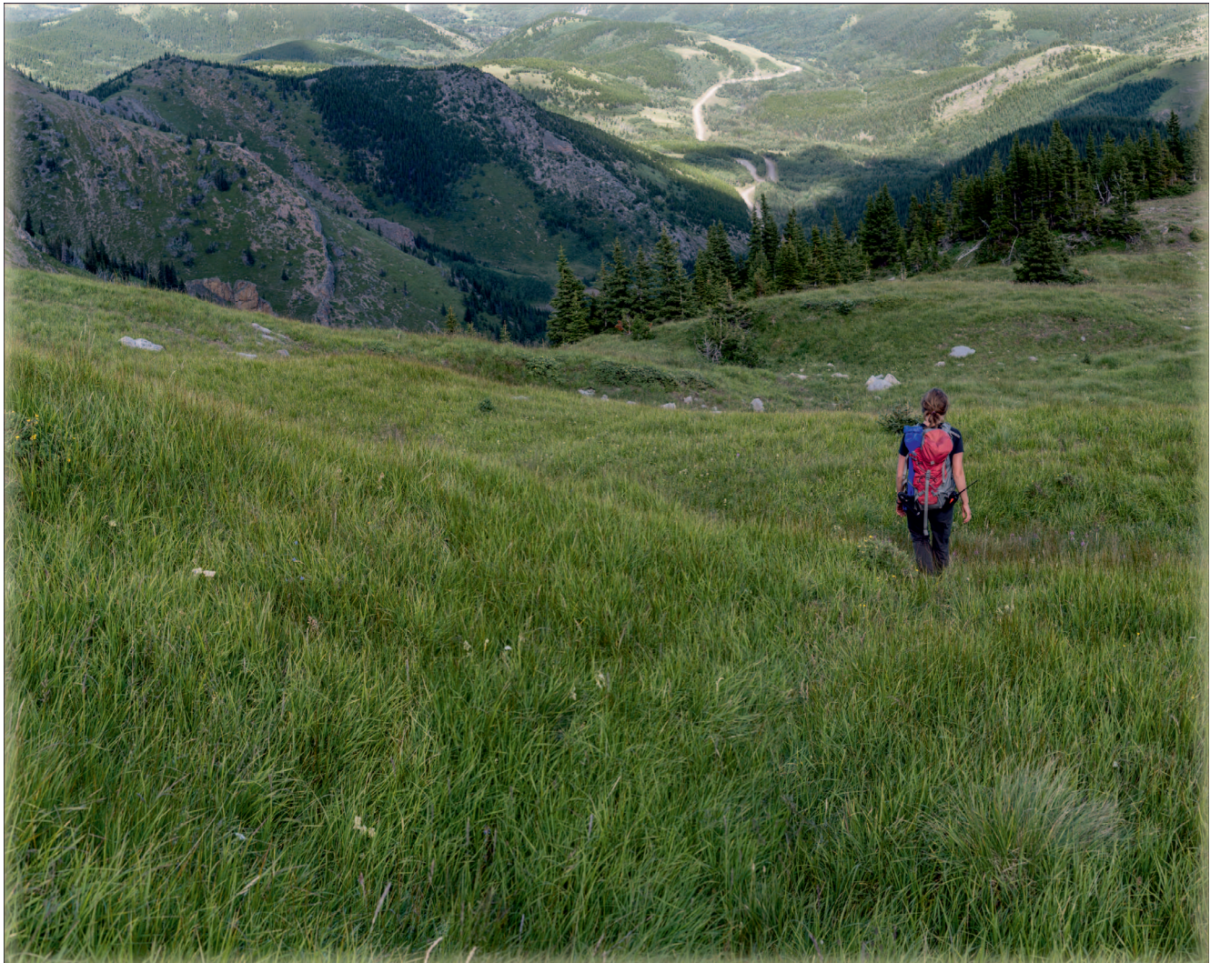
FIGURE 2 Hiking through subalpine terrain, southern Rocky Mountains, July 2015.